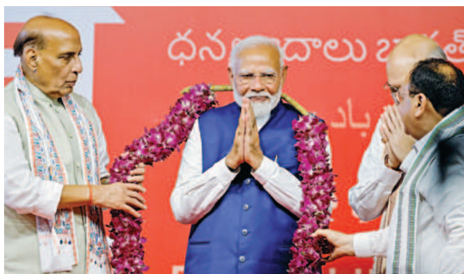
Indian Prime Minister Narendra Modi gestures at the Bharatiya Janata Party headquarters in New Delhi on June 4.

"You have the feeling that while the government was really geared towards