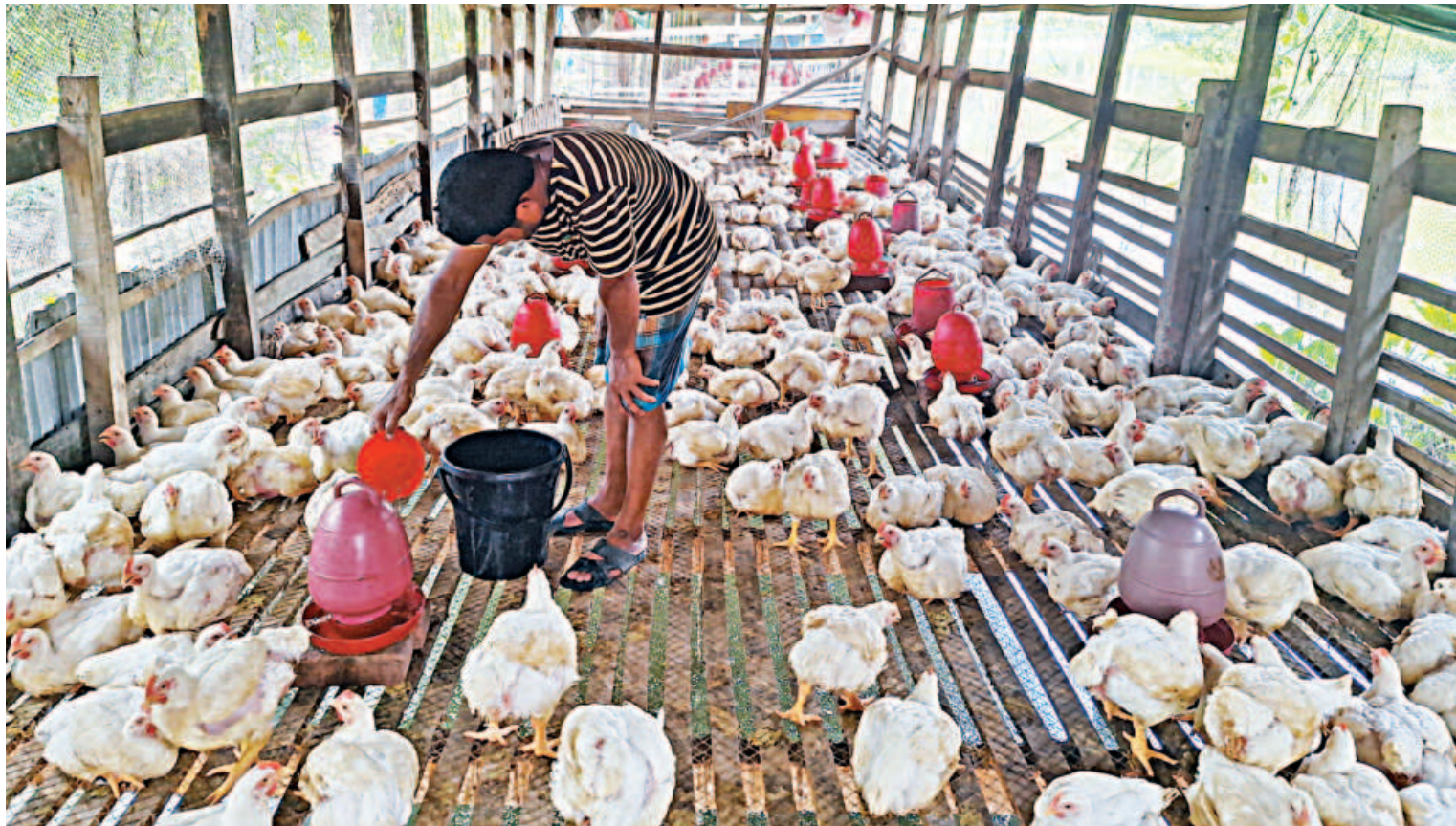
Each kilogramme of broiler chicken was selling for Tk 175 to Tk 200 in Dhaka yesterday, while a set of four eggs was selling for Tk 50 to Tk 53. The photo was taken from Habirkathi village of Jhalakathi district yesterday.