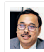
Nirod Chandra Mondal, Joint Secretary, Renewable Energy Wing, Power Division, Ministry of Power Energy and Mineral Resources

RVO is very pleased to see the formal launch of the HTCC programme in Bangladesh. We are confident that the Bangladesh team will continue to work closely with the private sector, the government and other relevant organisations to support a sustainable market for e-cooking appliances.