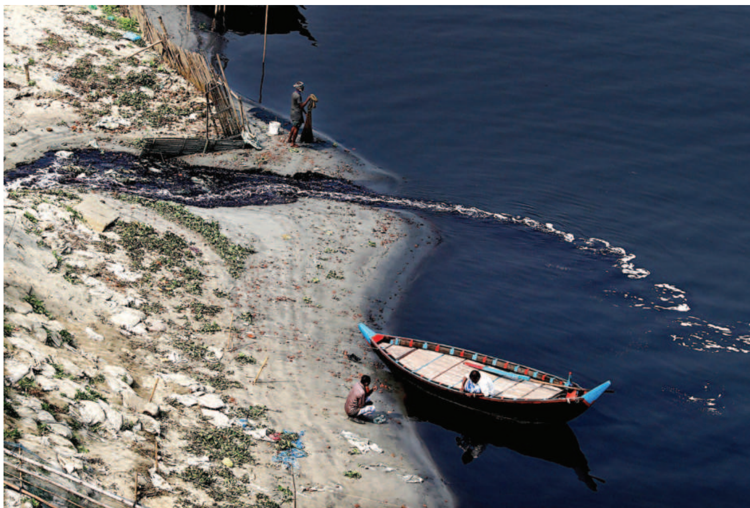
Liquid waste flowing into the Shitalakkhya from a storm sewer. In the absence of consistent and robust measures to protect them, our rivers continue to be victims of extreme pollution for years on end. The photo was taken yesterday.