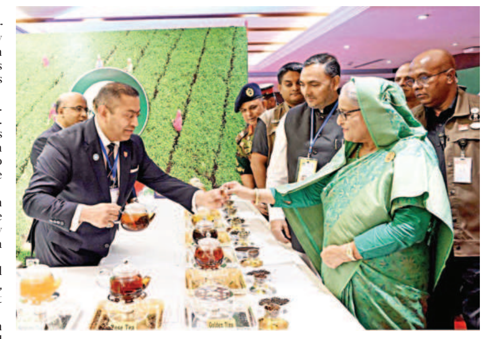
Prime Minister Sheikh Hasina samples tea on inaugurating the 4th National Tea Day 2024 at Osmani Memorial Auditorium in Dhaka yesterday.

cinnamon and clove flavoured tea as well.