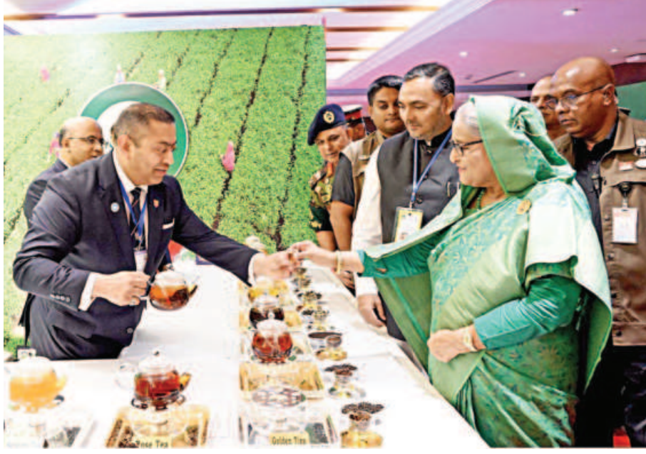
Prime Minister Sheikh Hasina samples tea on inaugurating the 4th National Tea Day 2024 at Osmani Memorial Auditorium in Dhaka yesterday.