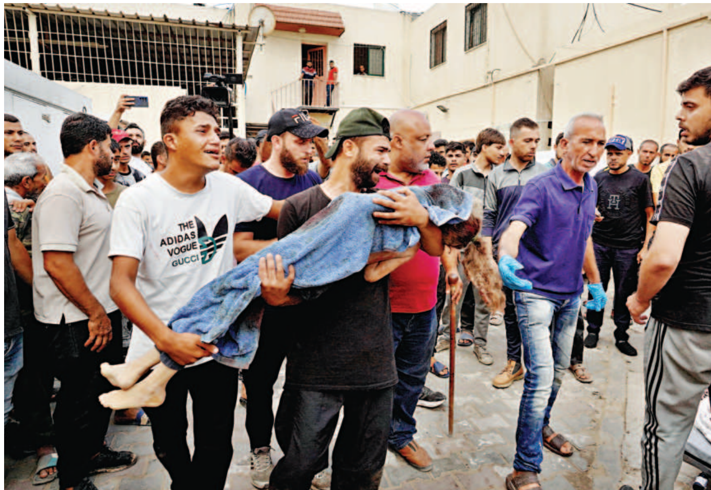
A Palestinian man carries the body of a young relative, killed by an Israeli airstrike the previous night, during preparations for a funeral outside the Al-Aqsa Martyrs Hospital in Deir al-Balah in the central Gaza Strip yesterday.