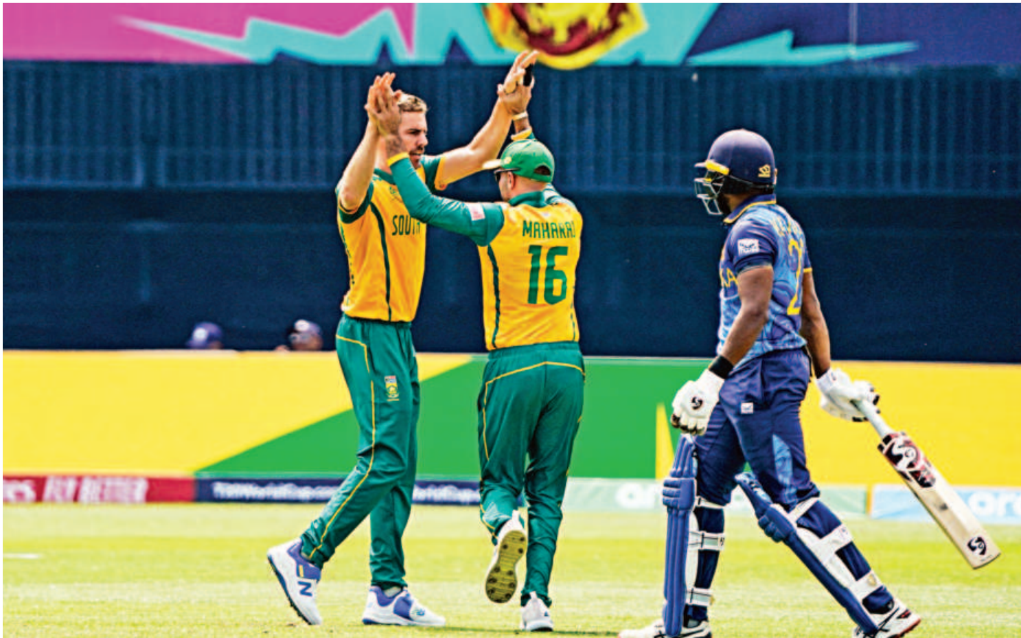
South Africa pacer Anrich Nortje (L) celebrates the dismissal of Sri Lanka's Kamindu Mendis in the first Group D match of ICC Men's T20 World Cup at Nassau County International Cricket Stadium in New York yesterday. Nortje's remarkable four-wicket haul helped the Proteas bundle out the 2014 champions for a lowly 77, paving the way for a six-wicket victory.