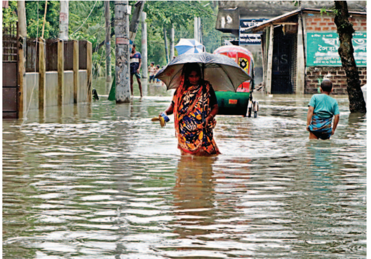
An elderly woman wades through knee-deep water in Sylhet city's Shahjalal neighbourhood yesterday afternoon. Due to the overflowing of rivers, overnight rains and mountain torrents, many areas in the city have gone under water, affecting at least 15,000 families. Due to the flooding, locals have been facing a shortage of food and clean water. Story on page 12.

He said the government has planned to increase power tariffs. SEE PAGE 2 COL 4