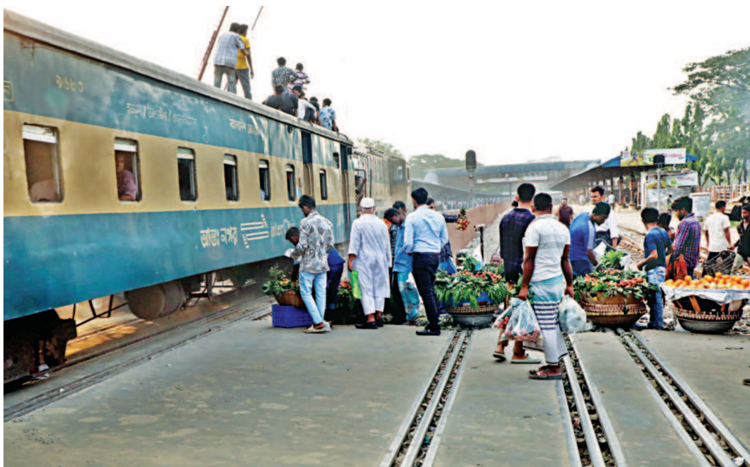
A train whizzes past fruit sellers who have placed themselves right on the lines near the Airport Railway Station, putting not only themselves but also their customers at risk. Multiple trains frequently pass through the station, opposite the Hazrat Shahjalal International Airport in the capital. The photo was taken yesterday.

Fresh areas in Sylhet flooded after heavy rain Over 6 lakh people stranded in 761 villages