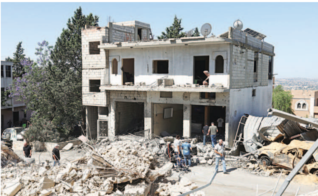
People inspect a damaged building amid ongoing cross-border hostilities between Hezbollah and Israeli forces in Houla village near the border with Israel, southern Lebanon yesterday. Hezbollah said yesterday it had launched a squadron of drones towards the headquarters of the Israeli military's Galilee formation.

More than 36,000 Palestinians have been killed in Israel's offensive, according to Gaza health officials.