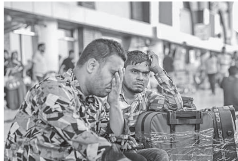
On Friday, several hundred workers waited for hours at the Hazrat Shahjalal International Airport to catch flights, but most of them could not do so.

According to a memorandum of understanding signed between Bangladesh and Malaysia in December, 2021, a Bangladeshi worker who wants to travel to Malaysia and work there would need to spend no more than Tk 78,990 for the passport, health check-up, registration, welfare, insurance, identity card, clothing, and recruitment agency fees. Malaysian employers were supposed to pay for