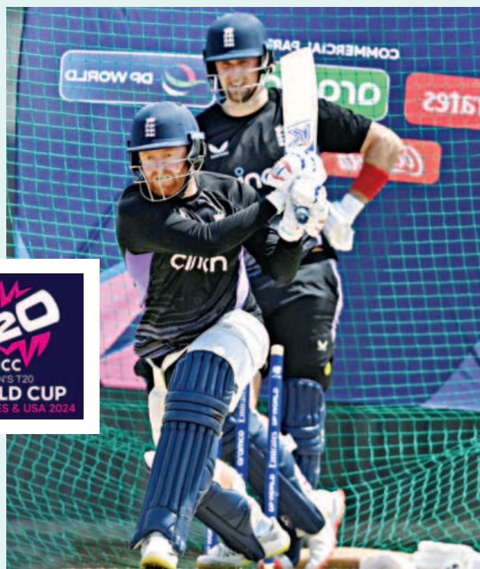
England batter Jonny Bairstow plays a reverse sweep with Liam Livingstone watching from behind the stumps as the defending champions prepare in their bid to become the first team to retain the T20 World Cup title with their opening group game against Scotland in Barbados today.

Now Rohit Paudel and his army will have to play their cards and focus on shifting their losing momentum and start their campaign on a positive note. They have recently lost their warm-up game to Canada.