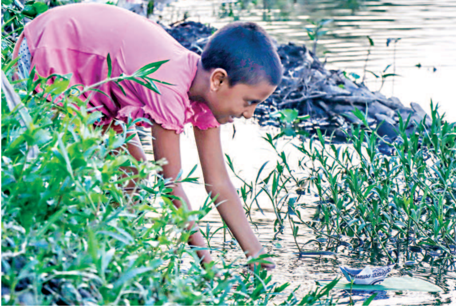
A young girl floats a paper boat into the water. Her face lights up with joy as the little boat drifts away. In many rural areas such activities are still popular. The photo was taken yesterday in Khulna's Phultala area.

The period also saw 20 women, including five girls, die by suicide.