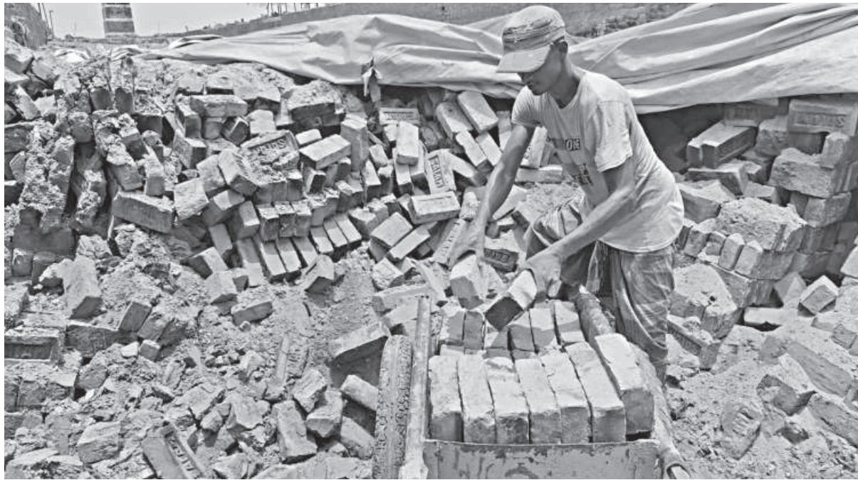
These bricks were shaped and left to dry before placing them in the furnace. However, in the aftermath of Cyclone Remal, most of the bricks turned into clay due to incessant rain. Now, workers are extracting the ones that have preserved their shape. The photo was taken the Doarika area of Barishal yesterday.