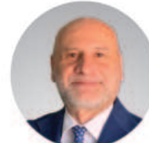
H.E. Antonio Alessandro Ambassador Embassy of Italy in Dhaka

VFS Global is the only authorised service provider for Italian work visas in Bangladesh and continues to work with the Italy Embassy to make the visa application process smoother, despite the growing number of applications.