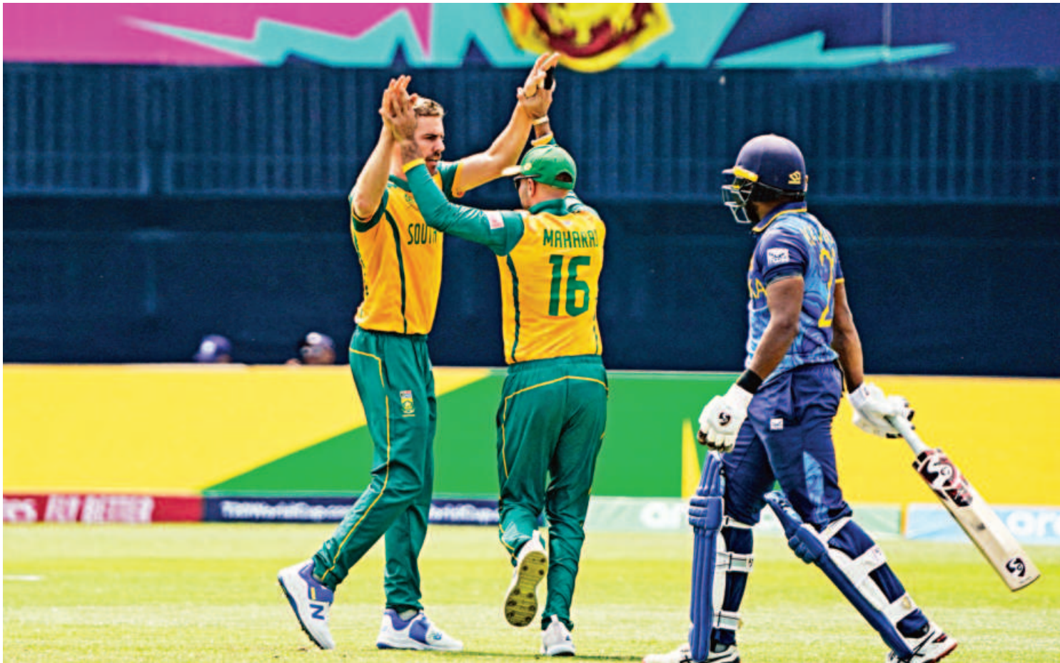
South Africa pacer Anrich Nortje (L) celebrates the dismissal of Sri Lanka's Kamindu Mendis in the first Group D match of ICC Men's T20 World Cup at Nassau County International Cricket Stadium in New York yesterday. Nortje's remarkable four-wicket haul helped the Proteas bundle out the 2014 champions for a lowly 77, paving the way for a six-wicket victory.