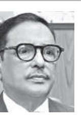
SEE PAGE 4 COL 1

"Did any media write about Benazir's corruption before Kaler Kantha did it? No one [before] dared to do