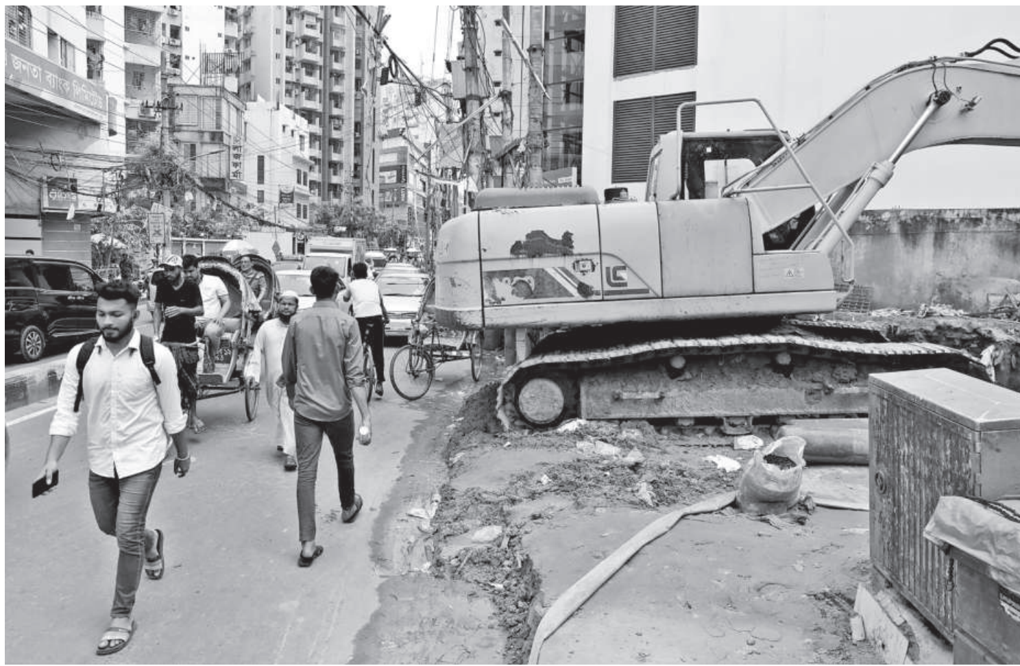
Construction of a building has left very little space for pedestrians to traverse the area safely. They are instead forced to walk on the road amid traffic. The photo was taken in the New Elephant road area yesterday.