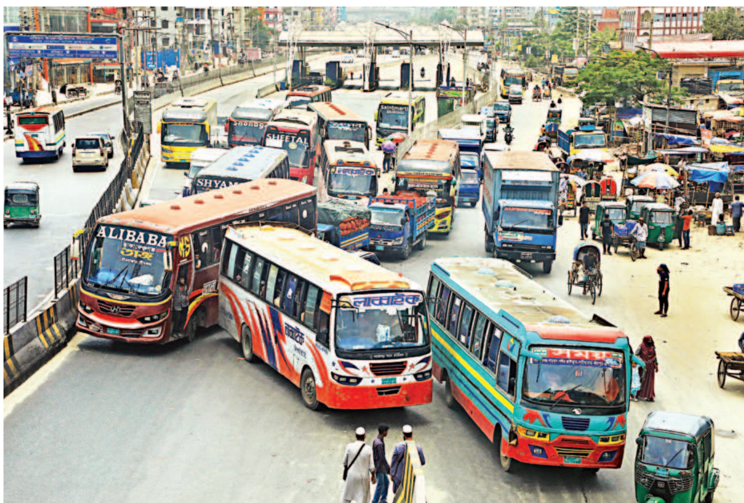
Buses picking up and dropping off passengers clog the Dhaka-Chattogram highway in the capital's Shanir Akhra yesterday. This forces passengers to take unnecessary risks and often creates tailbacks.