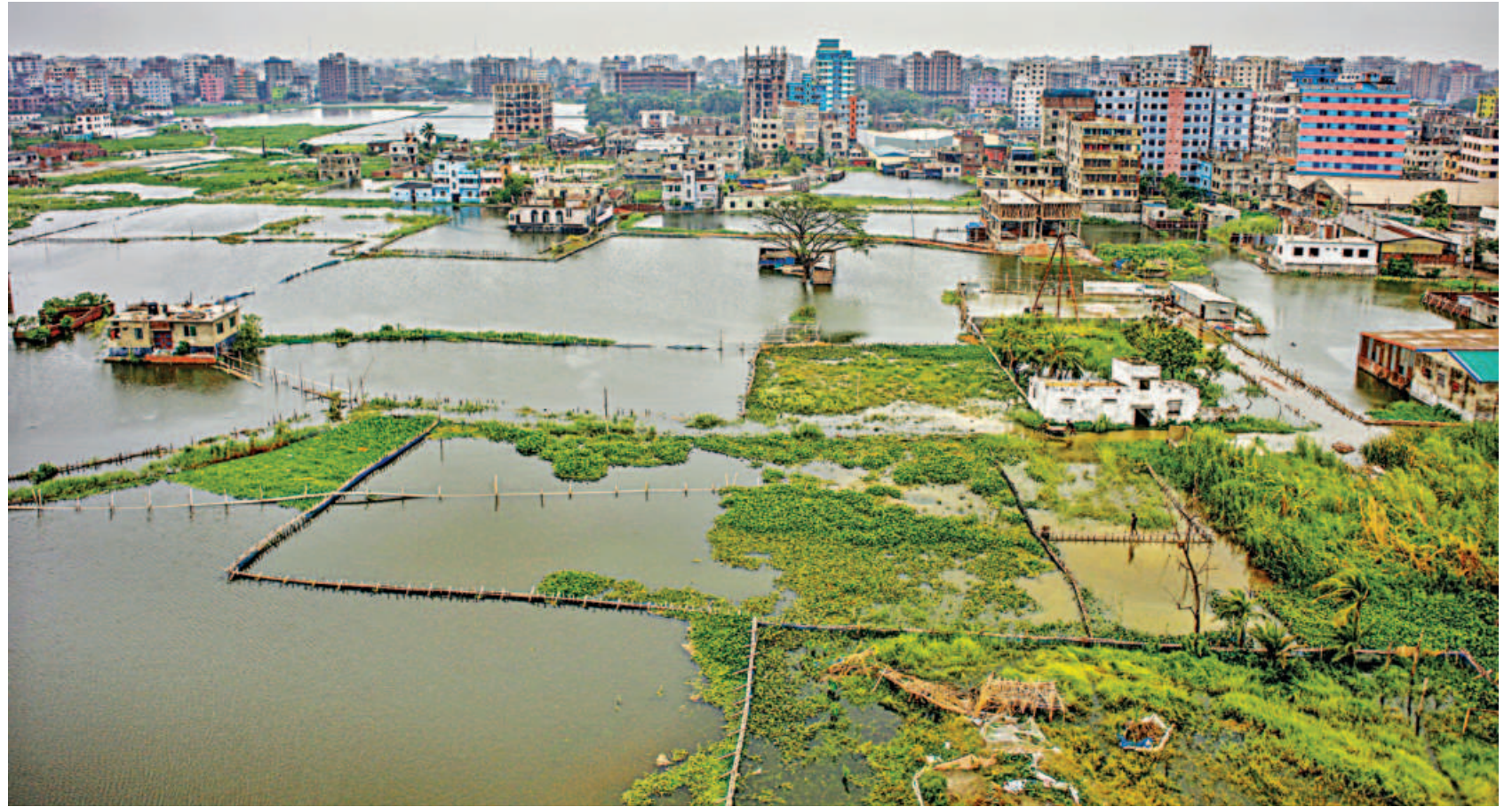
Owing to poor drainage, Matuail Medical Road area in the capital has been inundated following rain caused by cyclone Remal. Locals say they grapple with waterlogging issue for about four months a year. The photo was taken on Wednesday.

The upcoming budget will be the first one of the current government. The political situation is stable now, but the economy is facing a prolonged crisis.