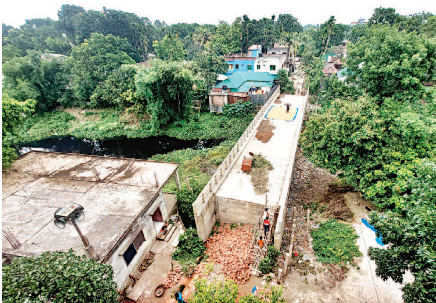
This bridge on the Louhajang river in Kachudanga area of Tangail town was built three years ago, but there is no approach road to it. Bamboo walkways built by locals offer a precarious crossing for pedestrians.