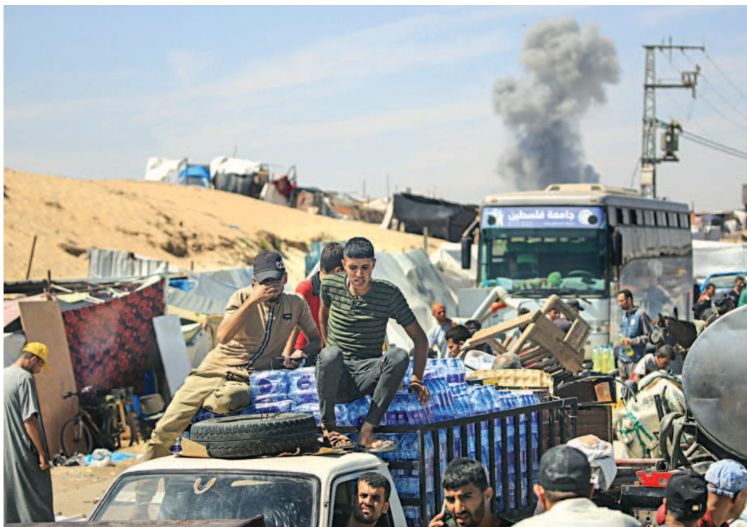
Smoke billows following Israeli bombardment as displaced Palestinians move in Rafah in the southern Gaza Strip yesterday.