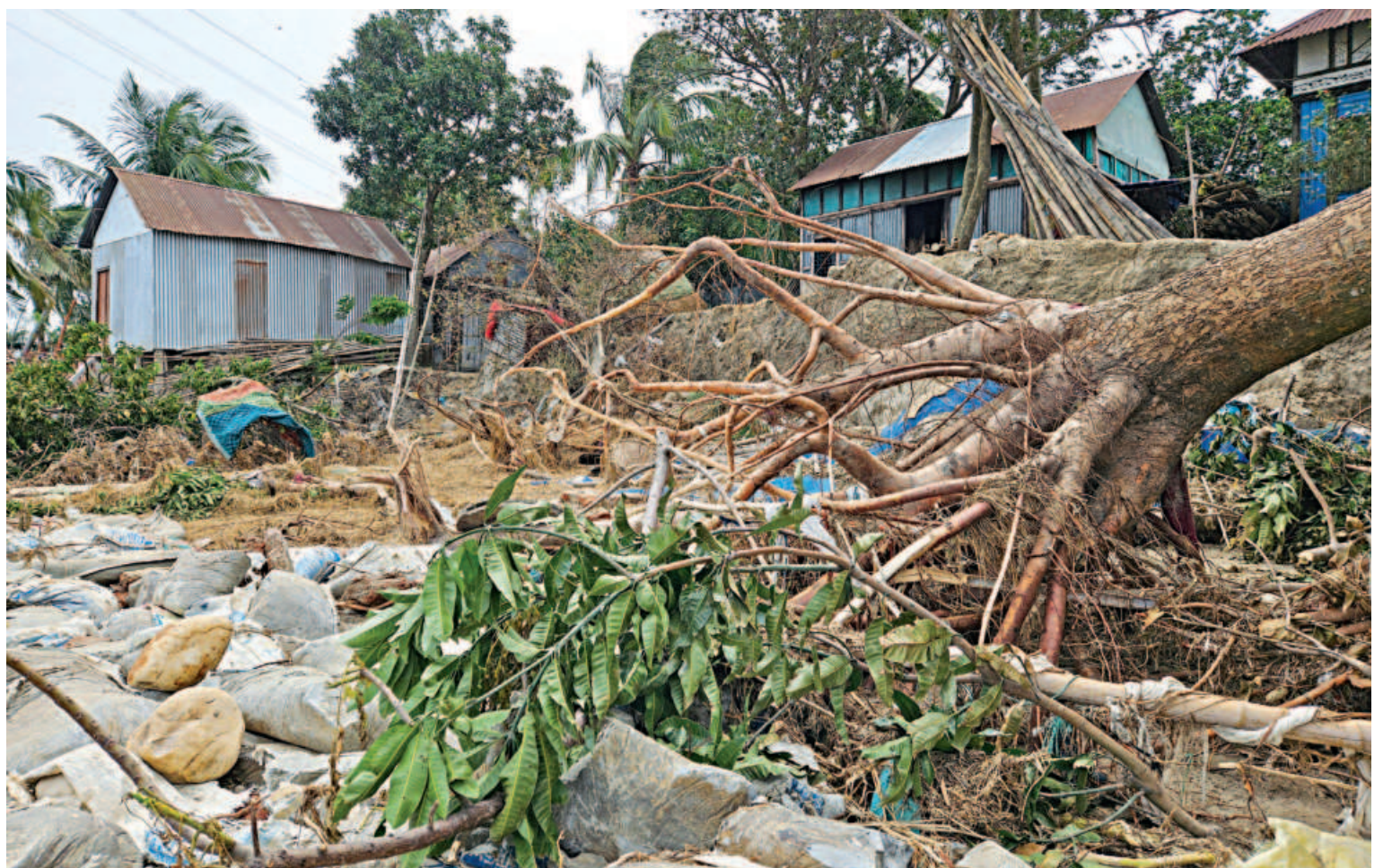
In the wake of Cyclone Remal, at least 16 tin-shed houses were completely destroyed and 10 damaged in Char Balaki village of Gazaria upazila, near the Meghna River in Munshiganj. Trees have fallen over, roads have been damaged and numerous livestock have been lost as well. Even four days later, locals are still repairing their damaged homes.