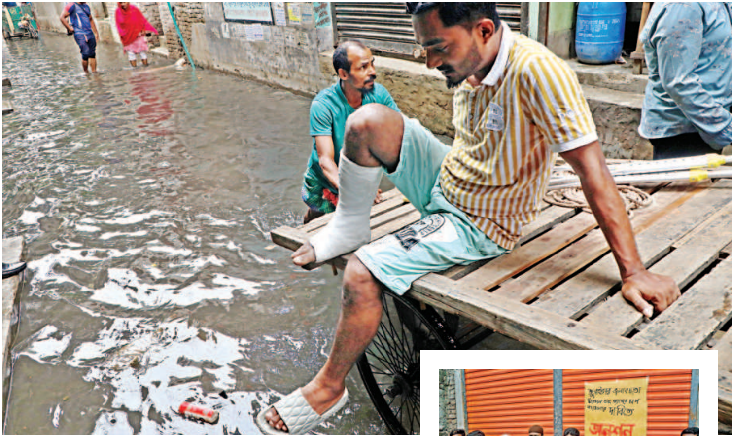
A man with a broken leg rides a rickshaw-van on the way to the hospital. He broke his leg after slipping in the waterlogged streets of his area on Monday. For more than three days, the waterlogging situation in Jurain area is yet to be solved. Inset, locals in a hunger strike protesting the prolonged waterlogging and low gas pressure, demanding an immediate resolution. The photos were taken yesterday.

Foreign Minister Mahmud thanked Guterres for his leadership on global issues, including the Gaza crisis, and urged continued UN focus on the Rohingya crisis, advocating for the safe repatriation of 1.3 million refugees.