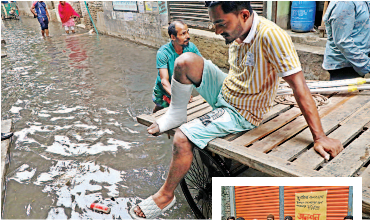
A man with a broken leg rides a van on the way to the hospital. He broke his leg after slipping in the waterlogged streets of his area on Monday. For more than three days, the waterlogging situation in the Jurain area is yet to be solved. Inset locals from the area have been protesting the prolonged waterlogging and low gas pressure, demanding an immediate resolution. The photos were taken yesterday.

UNB, Dhaka UN Secretary-General António Guterres praised Bangladesh as a vital UN partner, highlighting its contributions to international peace, sustainable development, and climate change efforts. During a meeting with Foreign Minister Dr Hasan Mahmud in New York, Guterres expressed gratitude for Bangladesh's support to the Rohingya and voiced concern over Myanmar's forced recruitment of young Rohingya. Commending Bangladesh's climate resilience, Guterres assured support for Bangladesh's transition from a low-income country, stating, "For this, Bangladesh should be rewarded, not punished." Foreign Minister Mahmud thanked Guterres for his leadership on global issues, including the Gaza crisis, and urged continued UN focus on the Rohingya crisis, advocating for the safe repatriation of 1.3 million refugees.