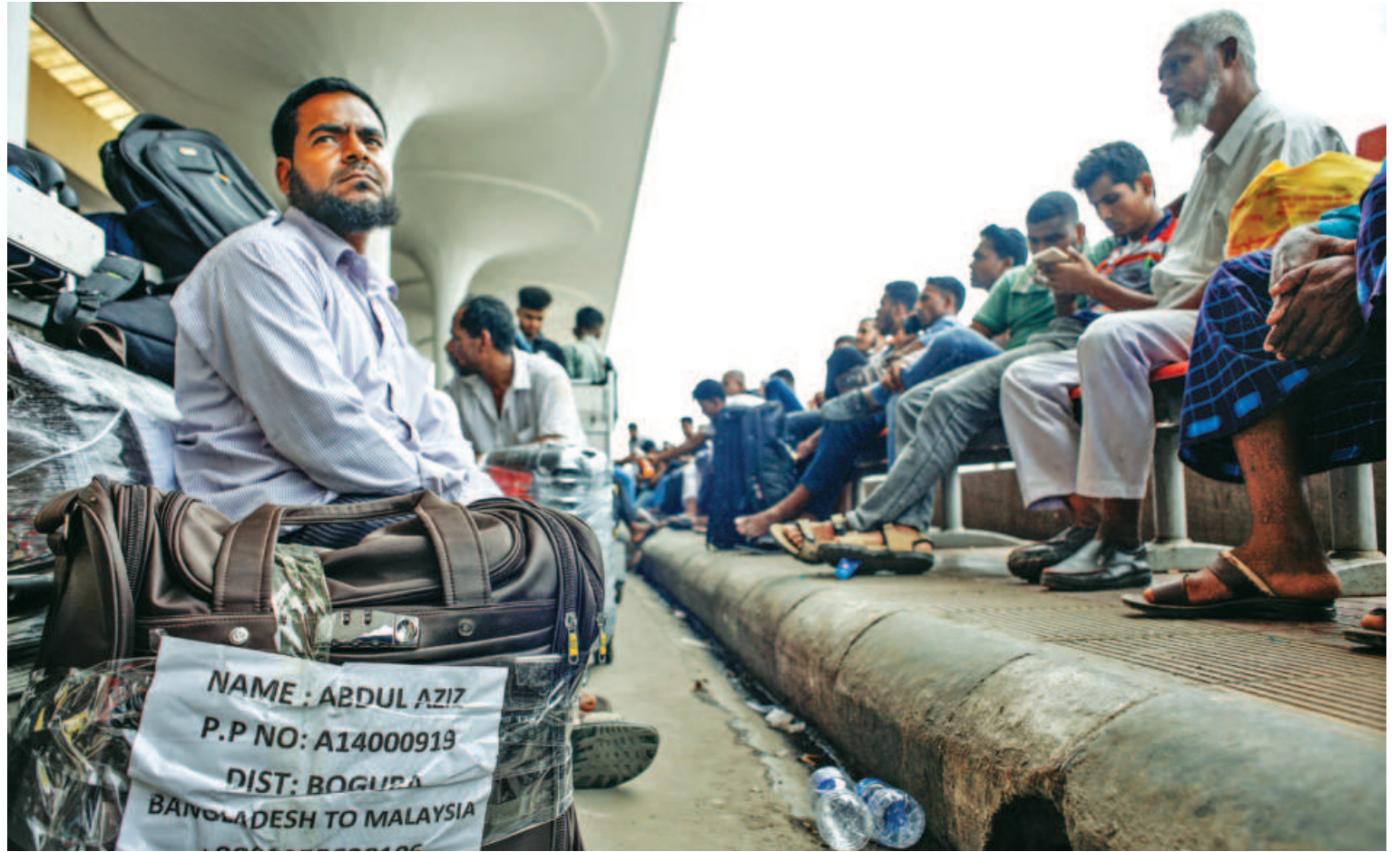
Jobseekers through Hazrat Shahjalal International Airport to catch flights for Malaysia. Many of them waited at the airport for about 10 hours after receiving assurances from manpower brokers that they would be flown to the Southeast Asian country before the expiration of the deadline for new Bangladeshi expatriates to enter the country at midnight last night. The photo was taken around 3:00pm yesterday.