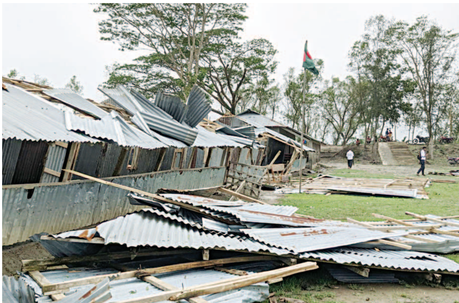
Cyclone Remal has caused extensive damage to Menhazpur Hakkani Secondary School on the bank of the Nilganj river in Patuakhali's Kalapara upazila. At least 474 educational institutions in the district have been affected by the cyclone that made landfall on Bangladesh coast on Sunday afternoon. The photo was taken on Wednesday.