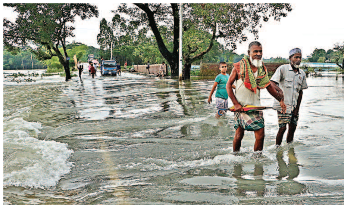
Two elderly men struggling to wade through the flooded main road of Lafnaut area in Sylhet's Gowainghat upazila. The road has been under water since yesterday as water has been gushing down from surrounding hills due to nonstop rain since Cyclone Remal's landfall.