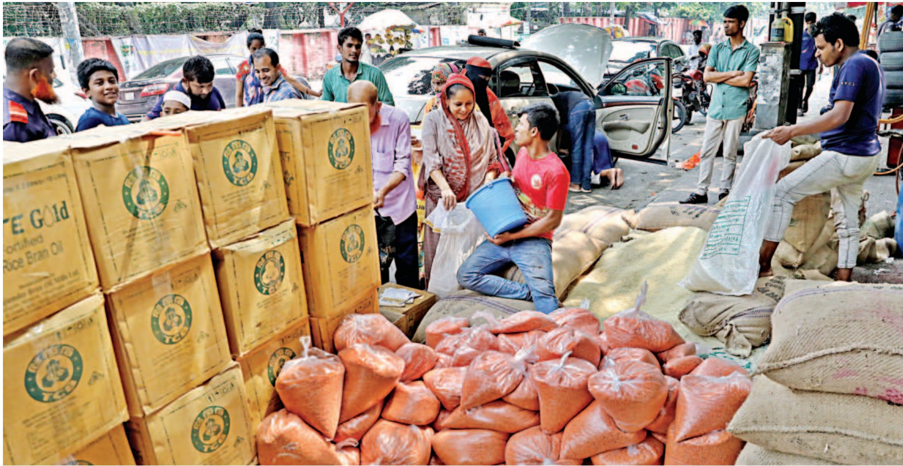
Essential food commodities being sold at subsidised rates through a dealer of state-run Trading Corporation of Bangladesh on Eskaton Garden Road in the capital yesterday. Each person registering with their local city corporation unit can avail two litres of edible oil, five kilogrammes of rice and two kilogrammes of lentils every month.