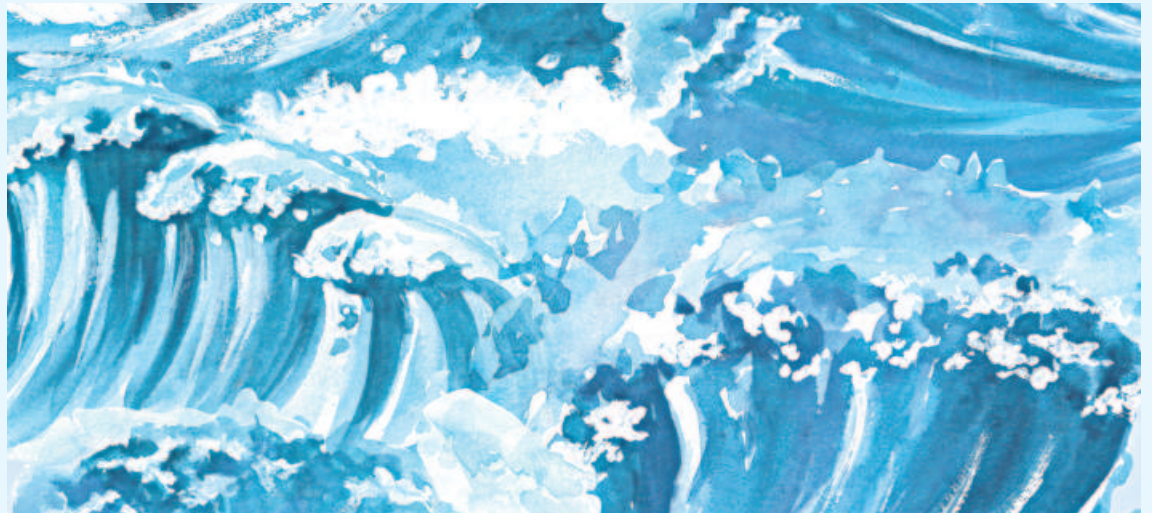
ILLUSTRATION: ABIR HOSSAIN

Grief is a lonely river Like a fisherman's song with an empty net Like a father walking home with empty hands Like a mother's existence Moonlight under a bamboo forest Birdsong or a death poem Today, I am an unwritten song A longing, a daydream, a hope Tomorrow, I will be the dust You were birthed from When the sun reflects off the floor tile There is warmth to be found at the base Lean on the sink, it's fragile, but it's there Tie together all the broken fragments piece by piece Cover your skin with patchwork and paint Quilted heliotrope- face the sun- Tilted posture and wilted spine Fat and slow cumulonimbus clouds Gaze at you from a distance- moving So inconspicuously, it's hard to see outside when You're so up close to the vanishing points of your vertices A-three-point perspective of all the lives You have dreamed of living but instead found yourself Sprawled down on the bathroom floor on a warm Thursday evening I promise you this When you stop clawing your eyes out You will find what you are looking for Even when and, alliteration for emphasis, Especially when The sun above your head is unkind You will start to see Beyond the absence of it In the absence of a light source With our sticks and rocks We will build a make-shift version of it That works just finely enough For us to wait out the storm outside