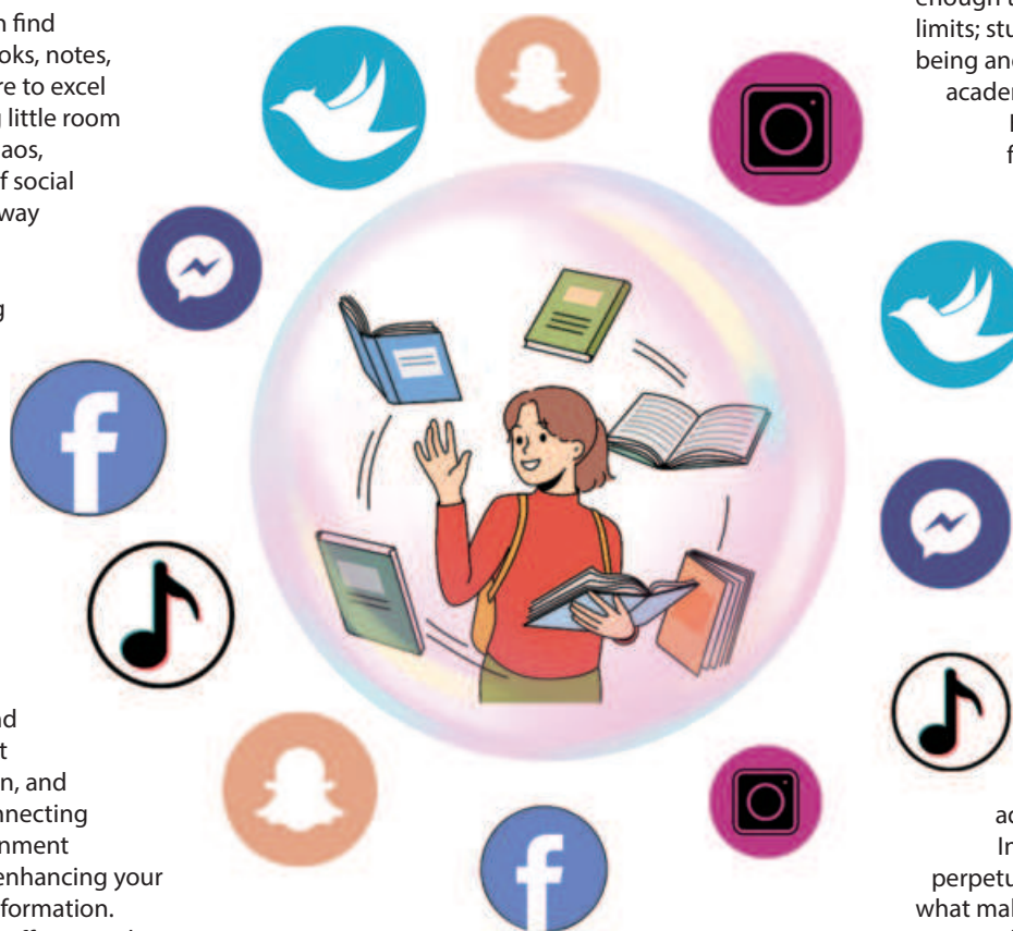
ILLUSTRATION: SYEDA AFRIN TARANNUM

Of course, integrating social media breaks into one's