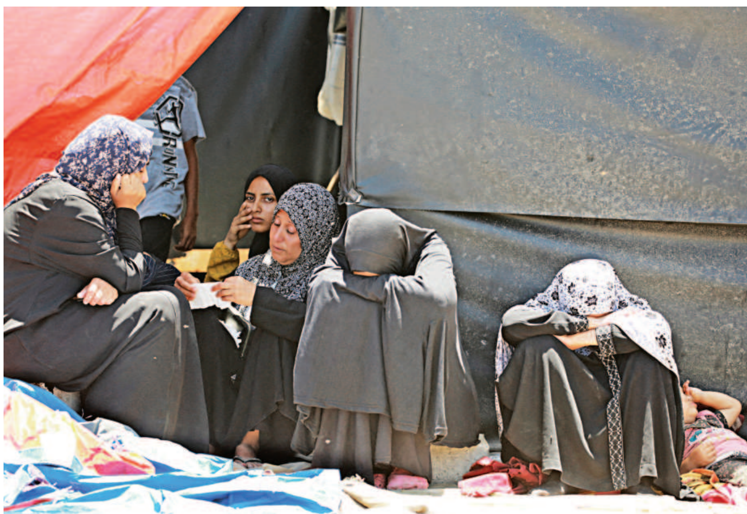
Palestinian women mourn relatives killed in Israeli bombardment as they sit by their displacement tent in Rafah in the southern Gaza Strip yesterday.