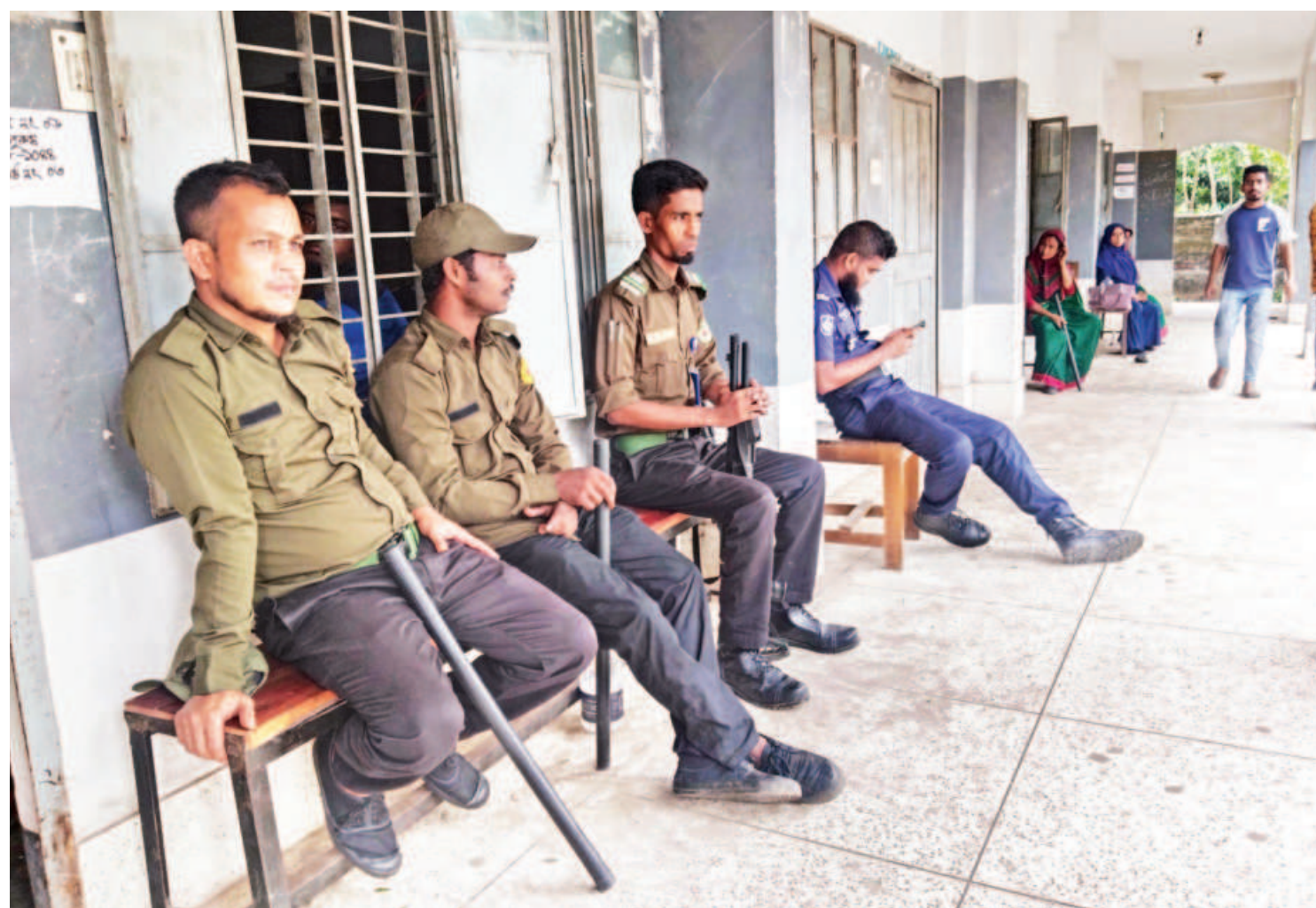
With no voters around, security personnel sit idle at the Araisidha Kamil Madrasa polling centre in Brahmanbaria's Ashuganj during the upazila polls. A total of 87 upazilas went to polls in the third phase of the elections yesterday.