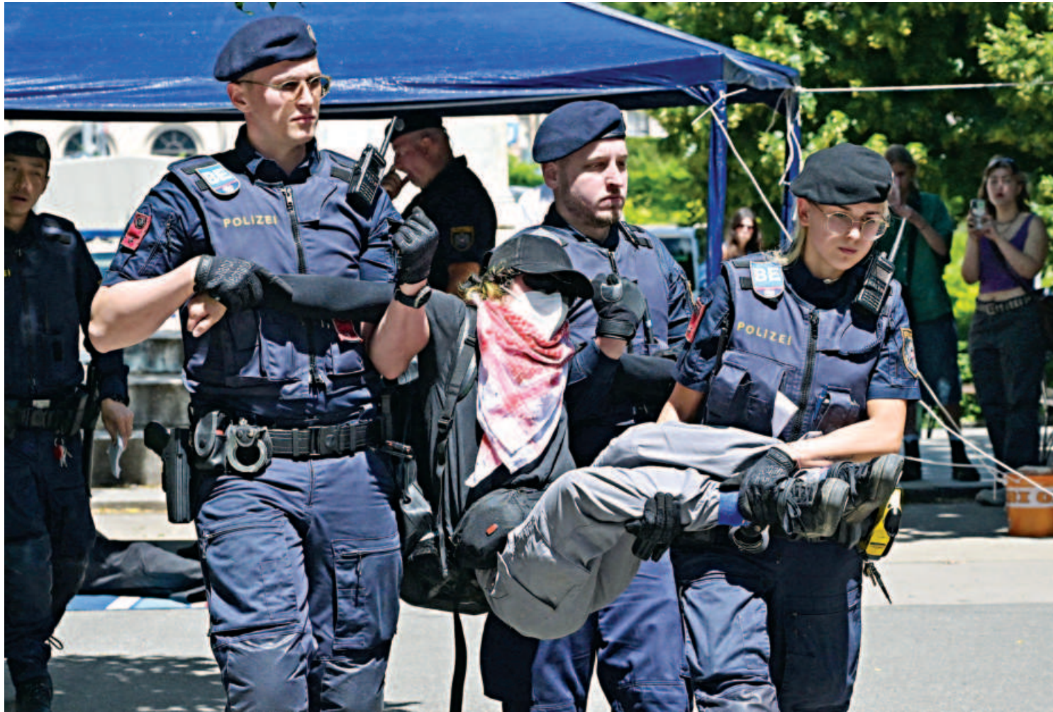
Policemen carry away a man from a so-called "Protestcamp fuer Palaestina" (protest encampment for Palestine) set up by students and sympathisers on the campus of the TU Wien Vienna University of Technology in Vienna, Austria, yesterday.

The IMD has issued a red alert health notice for Delhi, which has an estimated population of more than 30 million people.