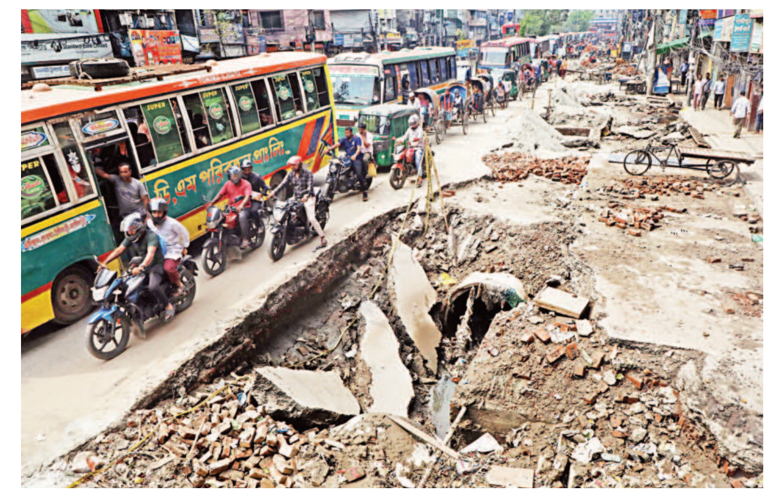
The authorities have dug up the North South Road in the capital's Bangshal to install underground drainage pipes, significantly narrowing the space for traffic. This has been causing tailbacks in the area for about a month. There are no barriers to prevent vehicles or pedestrians from falling into the trench. The photo was taken yesterday.

The government approved the Tk 1,721-crore Khulna-Mongla Port Rail Line SEE PAGE 2 COL 1