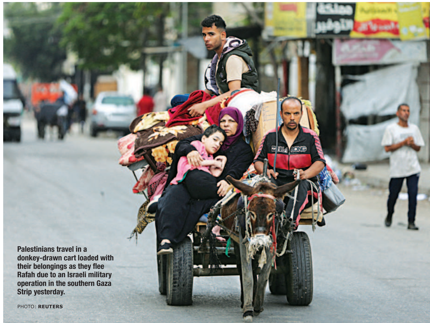
Palestinians travel in a donkey-drawn cart loaded with their belongings as they flee Rafah due to an Israeli military operation in the southern Gaza Strip yesterday.