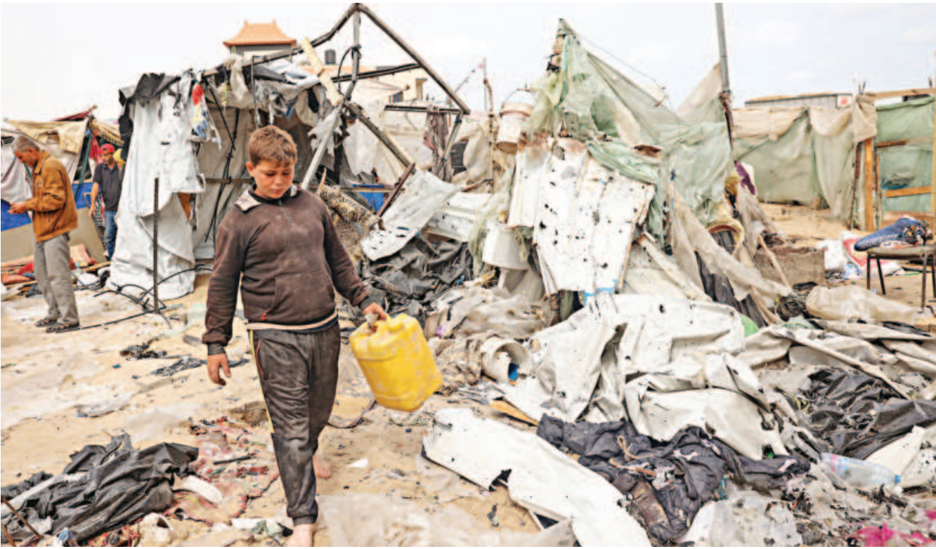
A Palestinian boy carries a container as he walks on debris at the site of an Israeli strike a day earlier on a camp for internally displaced people in Rafah in the southern Gaza Strip yesterday.

REUTERS, Dubai A Marshall Islands-flagged bulk carrier off the Yemeni coast took on water after being targeted with three missiles, maritime security and shipping sources said yesterday. The ship issued a distress call, saying it had sustained damage to the cargo hold and was taking on water about 54 nautical miles southwest of Yemen's port city of Hodeidah, British security firm Ambrey said. Greek shipping sources said the vessel, which bears the name Laax, was sailing to a port nearby to assess the extent of the damage. It was headed to the United Arab Emirates. Its Greece-based operator Grehel Shipmanagement did not immediately reply to a request for comment. The United Kingdom Maritime Trade Operations said separately yesterday that it had received a report of an incident 31 nautical miles southwest of Hodeidah.