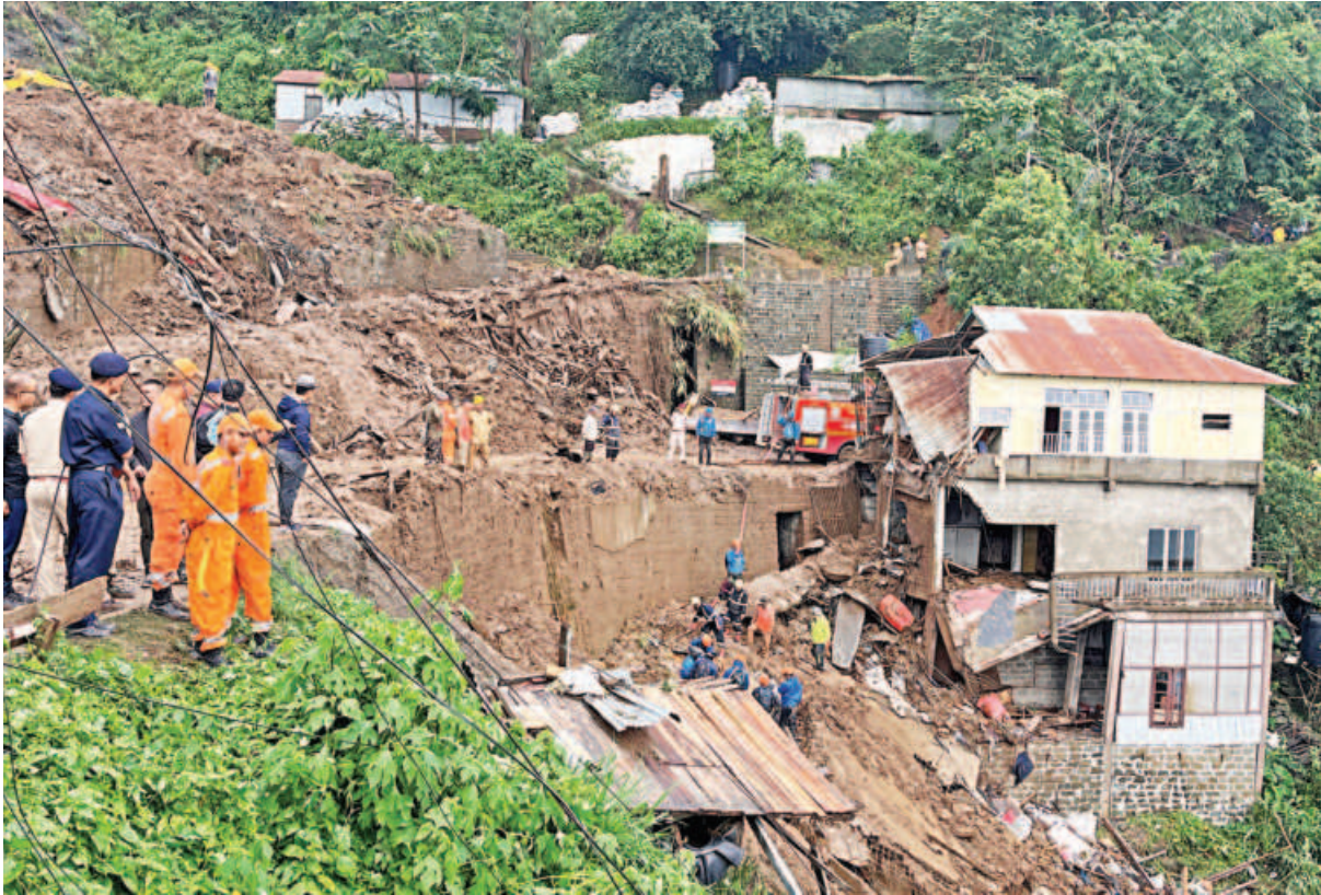
Members of rescue teams look for survivors amidst the debris next to a stone quarry that collapsed following torrential rains brought by cyclone Remal on the outskirts of Aizawl, the capital of northeastern state of Mizoram, India yesterday. So far 12 bodies have been found, said deputy commissioner of Aizawl district Nazuk Kumar.

AFP, Paris The world experienced an average of 26 more days of extreme heat over the last 12 months that would probably not have occurred without climate change, a report said yesterday. The report points to the role of global warming in increasing the intensity of extreme weather around the world. For this study, scientists used the years 1991 to 2020 to determine what temperatures counted as within the top 10 percent for each country over that period. Next, they looked at the 12 months to May 15, 2024, to establish how many days over that period experienced temperatures within -- or beyond -- the previous range.