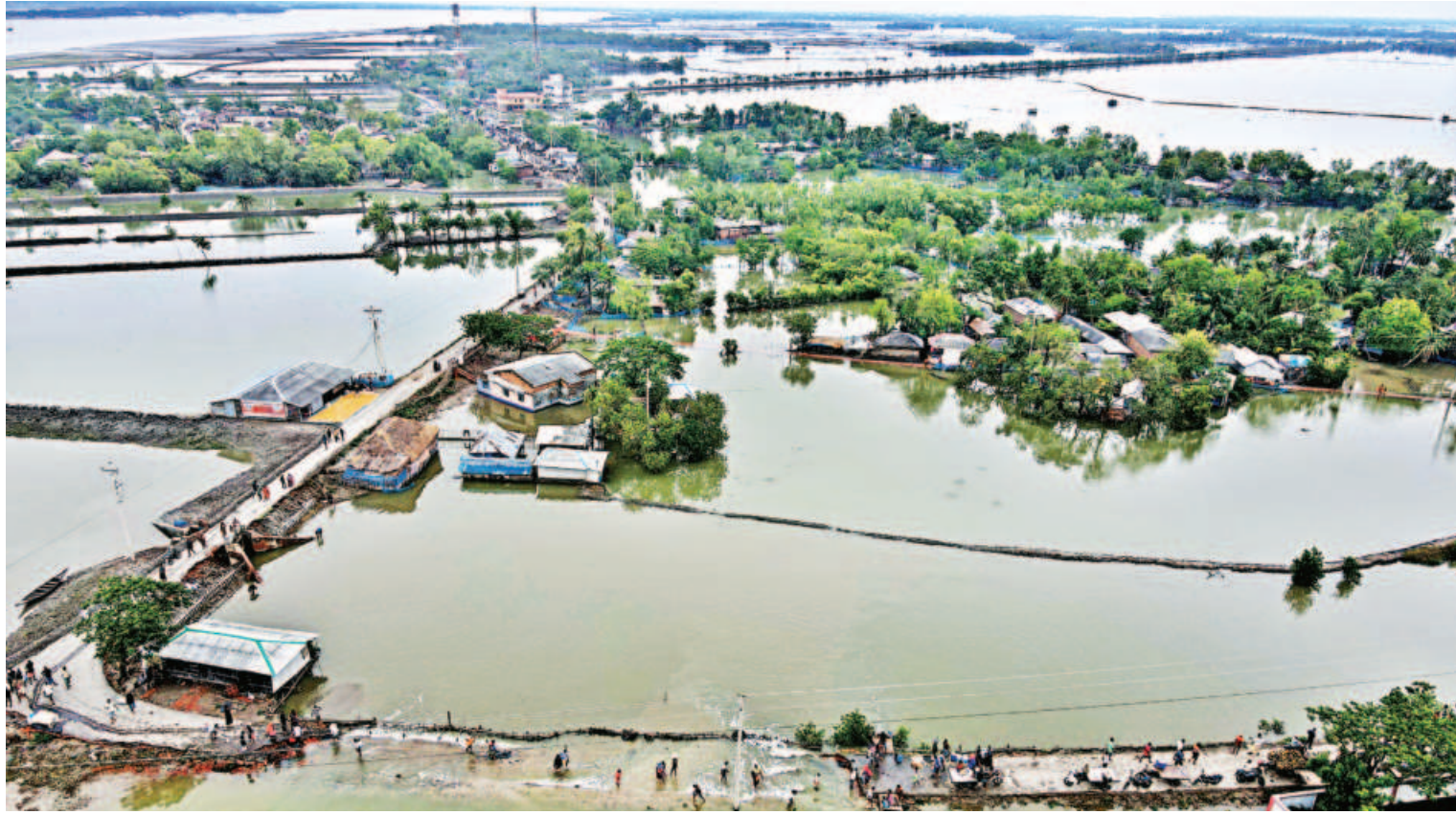
THE AFTERMATH ... Soldana and other neighbouring villages in Khulna's Paikgachha upazila have gone under water after Cyclone Remal breached a Shiba river embankment, washing away a large number of crab and shrimp farms. The water has also engulfed a part of a road that was vital for the villagers, further adding to their woes. Thousands of people have been affected by the flooding there. The photo was taken yesterday. More photos on P2.