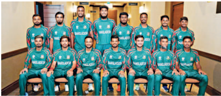
Bangladesh Cricket Board (BCB) revealed the official jersey that the Tigers will don in the upcoming T20 World Cup in the USA and the West Indies in a Facebook post on Monday.

Rash shots had been a big part of Bangladesh's batting failure in the second T20I against the USA, where they made a