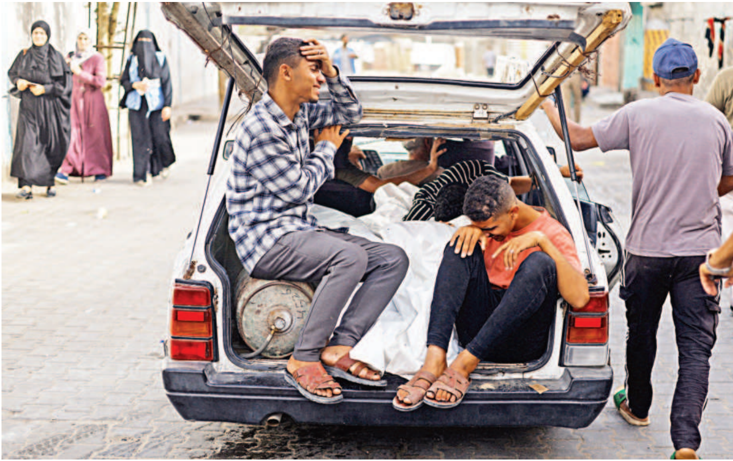
Palestinians mourn in a vehicle next to the bodies of their relatives killed in an Israeli strike on an area designated for displaced people in Rafah in the southern Gaza Strip yesterday.

The variance reflects the remote site and the difficulty getting an accurate population estimate. PNG's last credible census was in 2000 and many people live in isolated mountainous villages on the Pacific island nation.