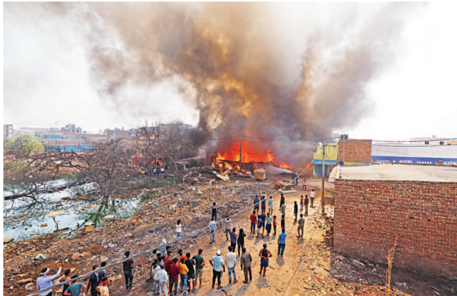
Fire fighters try to douse a fire in a shop near a landfill site during a heatwave in New Delhi, India yesterday. The India Meteorological Department (IMD) has issued a 'red' alert for heatwave in several parts of North India.

It added it was "aware of the reports that during the strike, two other suspects who were in the same vehicle as the terrorist were also hit".