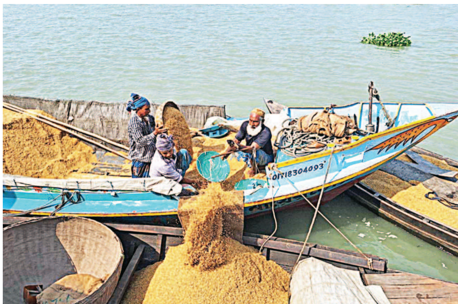
Traders moving rice grains from one boat to another at the floating rice market on the Sandhya river in Barishal's Banaripara upazila. Different varieties of rice arrive at this 200-year-old market from Bhola, Patuakhali, Pirojpur and more. These are sold on Saturdays and Tuesdays from 7:00am to 12:00pm. Local traders buy the grains at Tk 900 to Tk 1,300 per maund. The photo was taken recently.