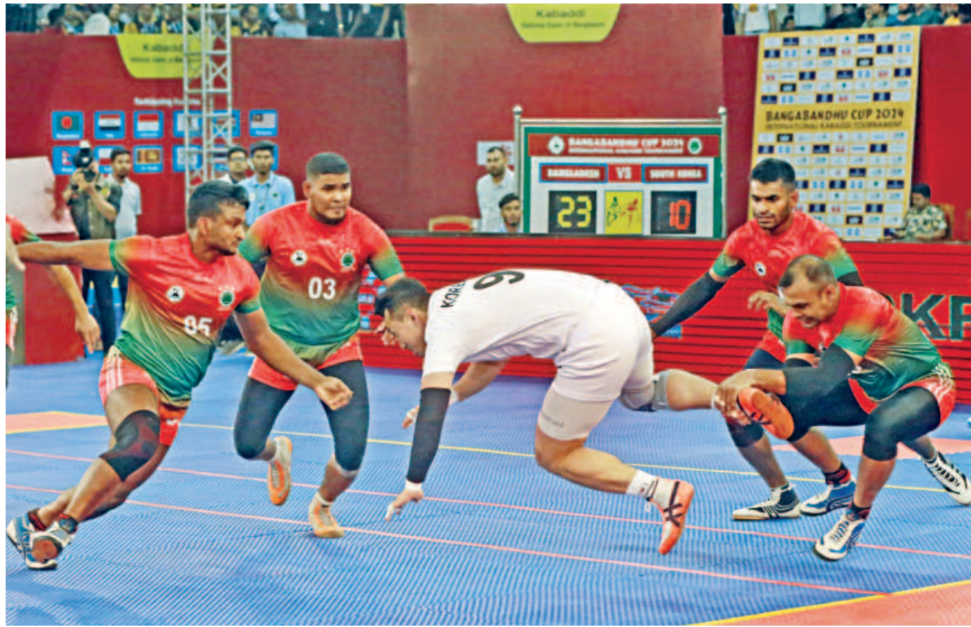
Bangladesh players catch a South Korea raider during the opening match of the Bangabandhu Cup International Kabaddi Tournament at the Shaheed Suhrawardi Indoor Stadium in Mirpur yesterday. Defending champions Bangladesh started the tournament with a bang, beating the Koreans by 67-22 points.