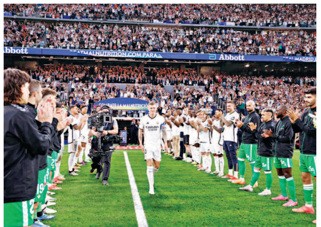
A goalless draw with Real Betis on the final LaLiga matchday on Saturday was largely irrelevant with Real Madrid already confirmed the league champions as the game was all about celebrating the 34-year-old Toni Kroos, who bade an emotional farewell to Los Blancos fans in his final game at a sold-out Santiago Bernabeu. Kroos, who announced he would retire from football at the end of Euro 2024, tried to hold his tears back as he was accorded a guard of honour by his teammates, all wearing his number eight jerseys, the opposition and the fans holding up a giant flag with his face and the words "Thank you, legend".

"I don't want to play him in the first round, but it is how it is. Everybody now is excited for a tough battle and tough first round. I think he's excited and I'm excited for it."