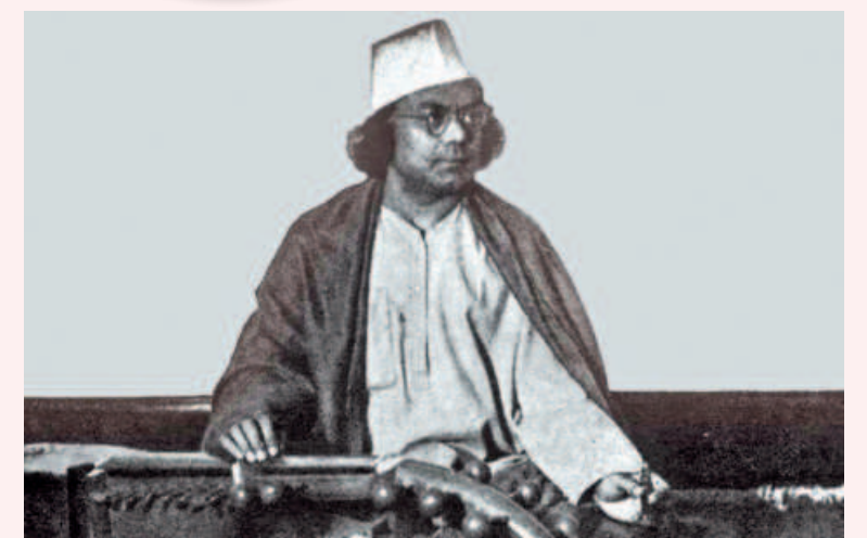
Portrait of Kazi Nazrul Islam, sketch by Zainul Abedin, 1946

echoed K.A. Wadud's concerns: “He holds a pre-eminent place in the story of efforts to communicate through music the ideal of a nationalism rising above religious differences.”