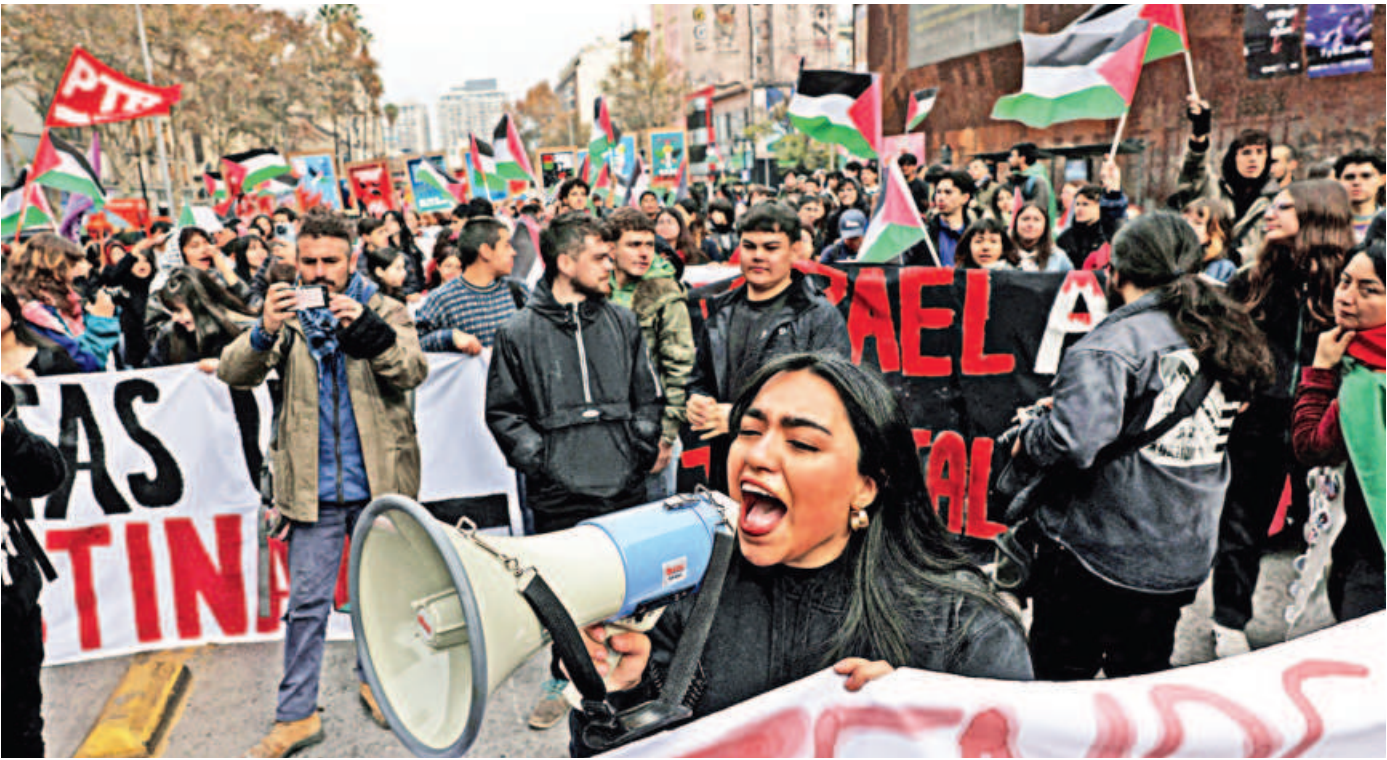
A student shouts slogans during a march as students occupy the main building of the University of Chile in support of Palestinian people in Gaza, amid the ongoing conflict between Israel and Hamas, in Santiago, Chile, on Friday.

Apart from the FBCCI, leaders from Dhaka Chamber of Commerce and Industry; Bangladesh Garment Manufacturers and Exporters Association; Bangladesh Textile Mills Association; Bangladesh Knitwear Manufacturers and Exporters Association; cement manufacturers association; and many other chambers and trade bodies attended the meeting.