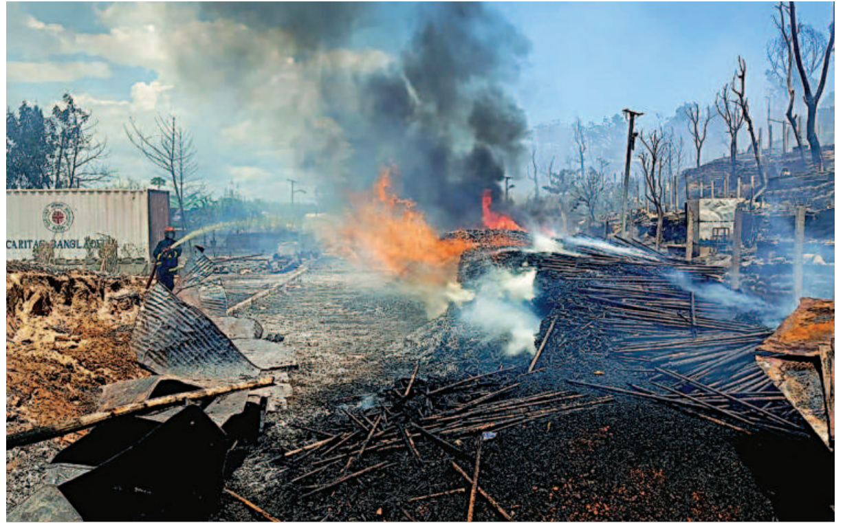
A firefighter sprays water at a blaze that burnt down at least 230 shanties at a Rohingya refugee camp in Ukhiya, Cox's Bazar, yesterday. At least 10 people were reported injured while trying to flee from the crammed dwellings. Story on page 12.