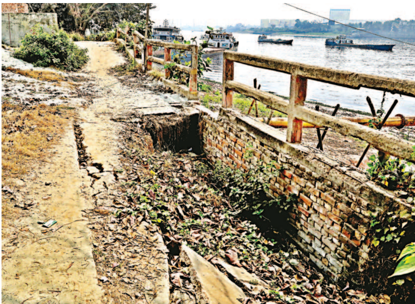
A part of the walkway along the Buriganga has caved in at Kadamtali in Narayanganj's Pagla due to a lack of maintenance. Berthing of cargo vessels for unloading sand and bricks in the area also causes damage to the walkway. The photo was taken recently.