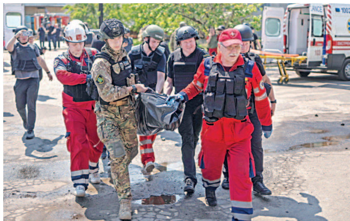
Emergency workers carry the body of a person killed by Russian missile strikes at a compound of a printworks, amid Russia's attack on Ukraine, in Kharkiv, Ukraine yesterday.

"But today you crossed all limits. To break me you targeted my old and ailing parents... God will not forgive you," Kejriwal, who was arrested in the Delhi excise policy-linked money laundering case, said.