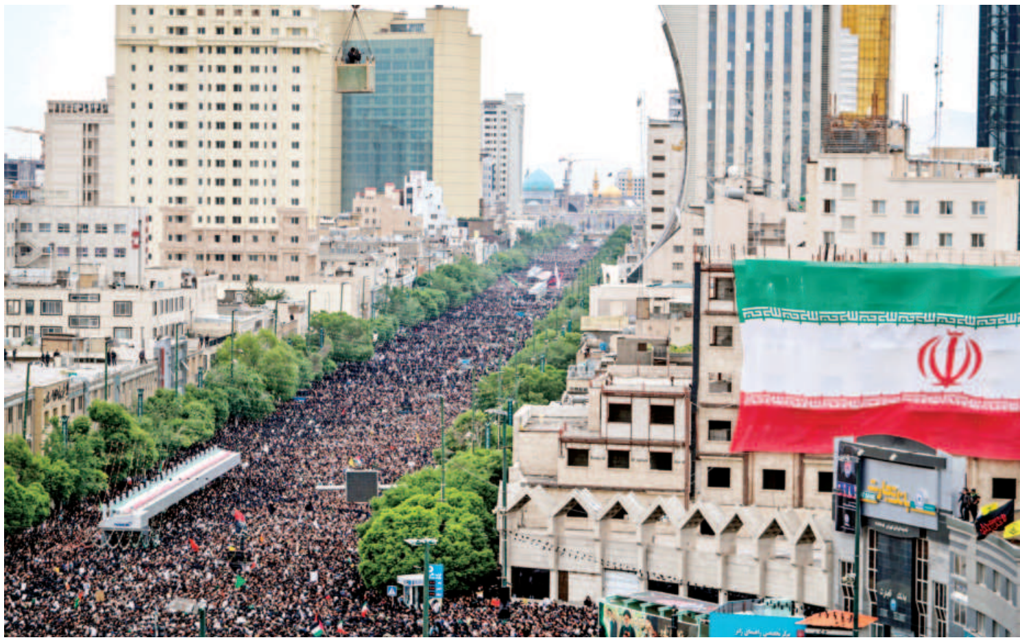
Tens of thousands of mourners attend a burial ceremony of the late Iranian president Ebrahim Raisi in Mashhad, Iran yesterday. Raisi was laid to rest at the gold-domed Imam Reza shrine, the holiest Islamic site in Iran and revered by Shia Muslims as the resting place of the 9th century Imam Ali al-Reza.

The UK Maritime Trade Operations also reported an incident at the same location, with "a missile impacting the water in close proximity" to the ship.