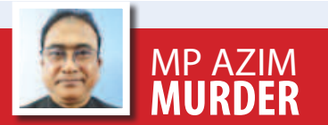
MP AZIM MURDER