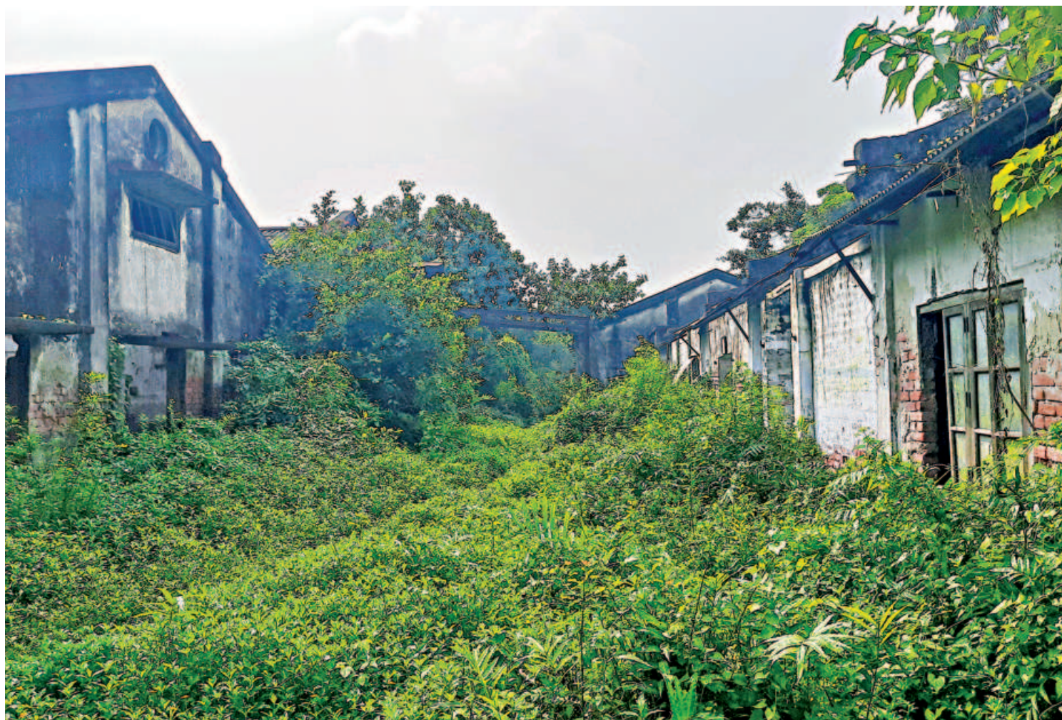
The Dada Match factory in Khulna city is seen covered in overgrowth as the grounds have remained vacant ever since the factory's closure in 2010. With virtually no initiatives having been taken to reopen the unit, most of the machinery and equipment have either been destroyed or stolen. The picture was taken recently.

Bluestar Agro and Winery Pvt won first place in the cottage industry category, followed by Preeti Beauty Parlour in second and Lehas Salma Jubo Women's Welfare Organisation in third. In the high-tech industry category, Bizz Solutions won an award.