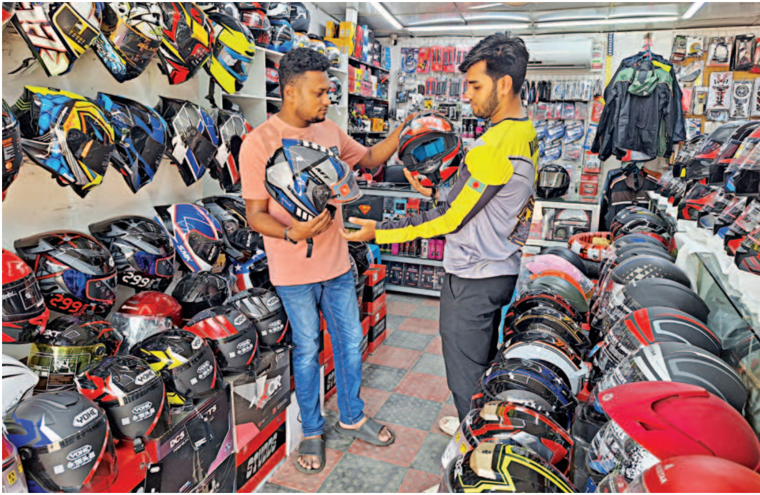
A buyer is seen comparing two helmets at a shop in Barishal city. Helmet sales have practically doubled ever since the authorities started imposing a "no helmet, no fuel" policy to improve road safety, according to market players. The picture was taken yesterday.