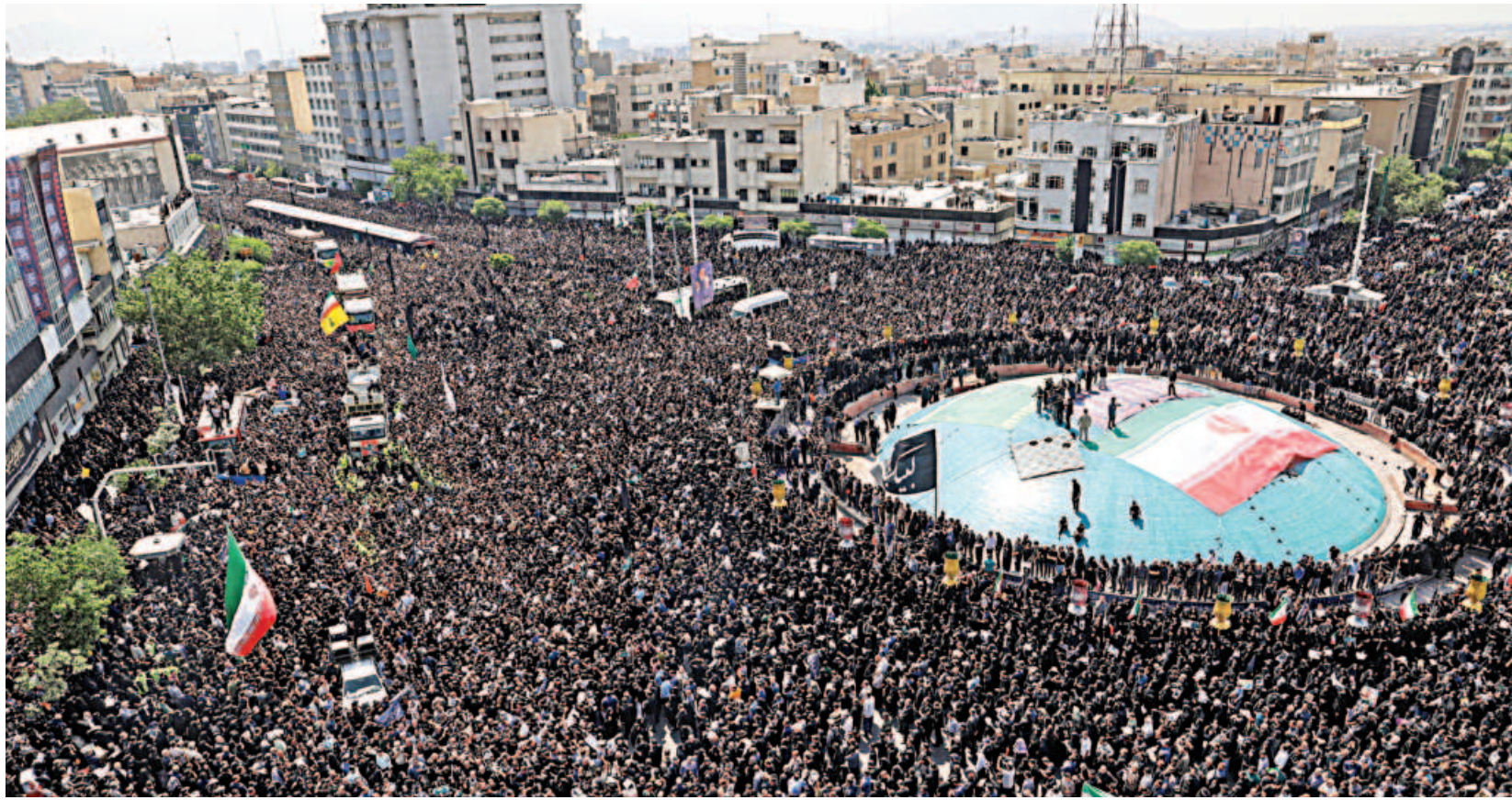
Mourners attend a funeral for victims of the helicopter crash that killed Iran's president Ebrahim Raisi, foreign minister Hossein Amirabdollahian and others, in Tehran, Iran yesterday.