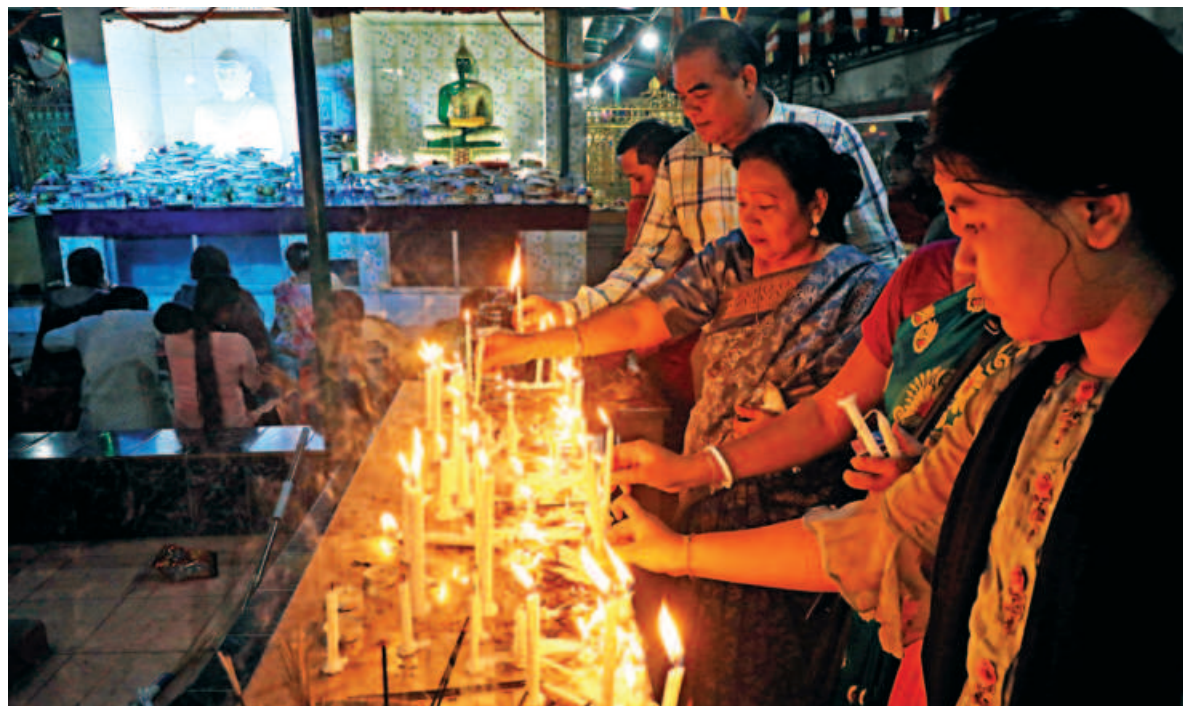
Buddhists lighting candles at the Basabo Buddha Mandir in the capital yesterday as part of celebration of the Buddha Purnima, the biggest religious festival of the Buddhist community. Buddha Purnima marks the birth, enlightenment, and death of Gautama Buddha.