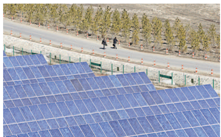
People walk past the solar panels at a wind and solar power site of State Grid Corporation of China in Zhangjiakou of Hebei province.

"In the next couple of years, this is going to be a huge problem that all provinces will face as grids are oversaturated, the infrastructure is overwhelmed," said Cosimo Ries, an analyst with Trivium