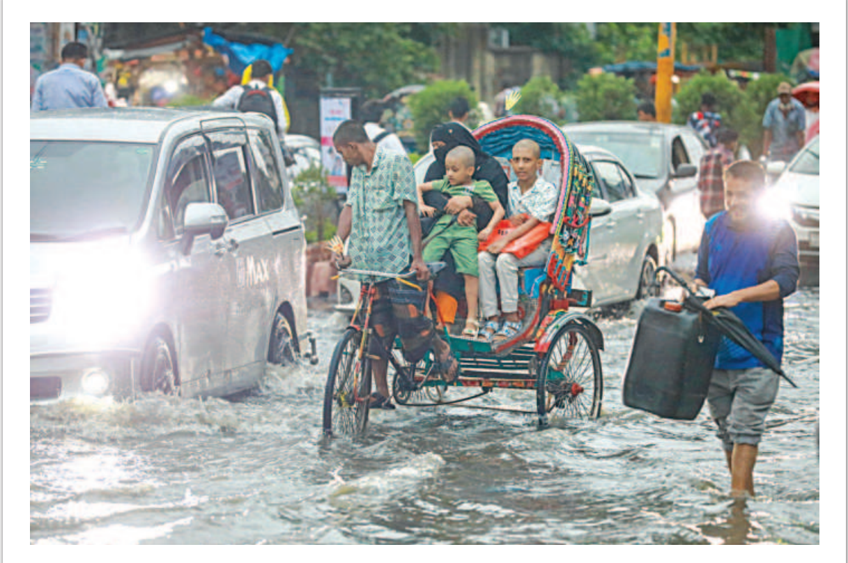
Heavy rain lasting over an hour on May 6 this year left the entire Prabartak Mor area of Chattogram city waterlogged.

Earth was seen piled up in the Chattogram Development canal while excavation materials were