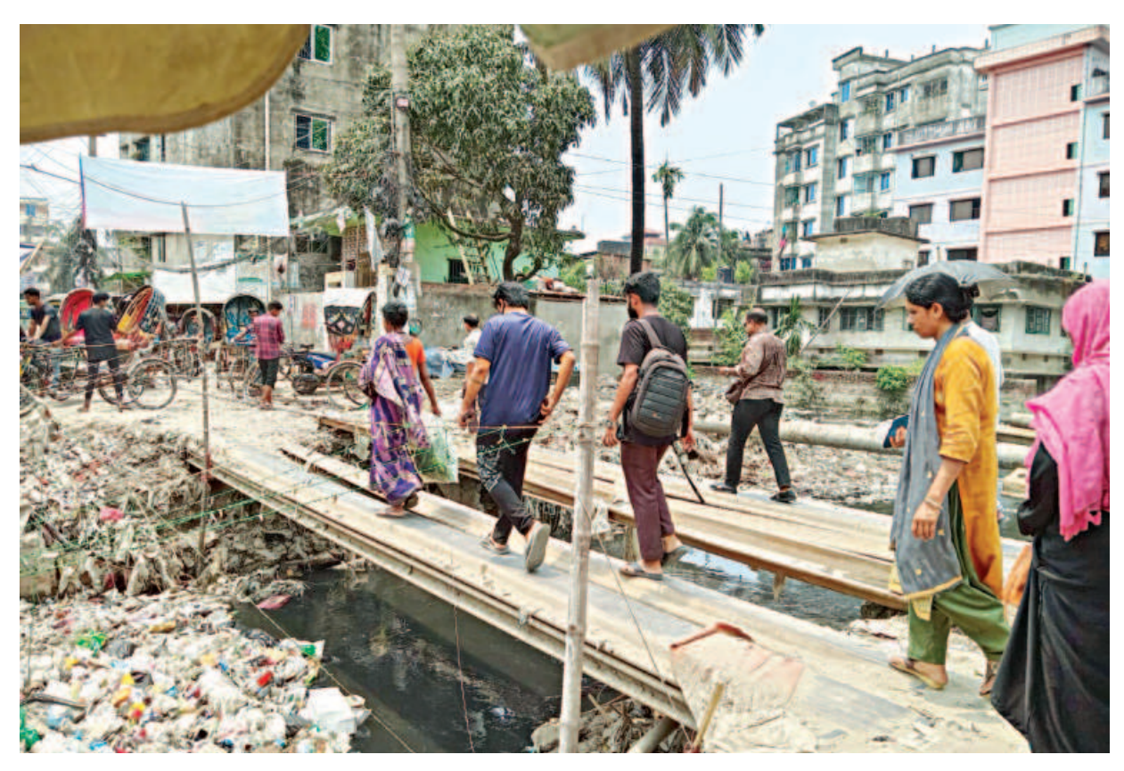
People cross this makeshift pathway, set up as part of ongoing works, in Chawkbazar Phooltala area. This temporary pathway not only makes it difficult for vehicles to cross, but also poses a risk to people as they can fall into the canal at anytime.

The loss of lives and civic hardships continue despite a Tk 8,626.62 crore mega project by the Chattogram Development Authority, which is currently underway, aimed solely at addressing waterlogging. This photo was taken recently in Ambagan Shaheed Lane area.