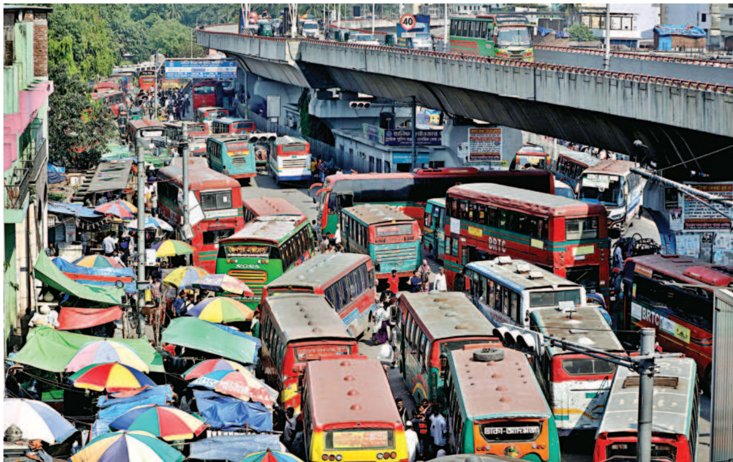
Buses caught in traffic near the Gulistan ramp of Mayor Mohammad Hanif Flyover. Buses waiting to pick up passengers and those making U-turns aggravate the congestion there. Pedestrians cannot use the footpath which has been occupied by ticket counters and hawkers. The photo was taken around 2:30pm yesterday.