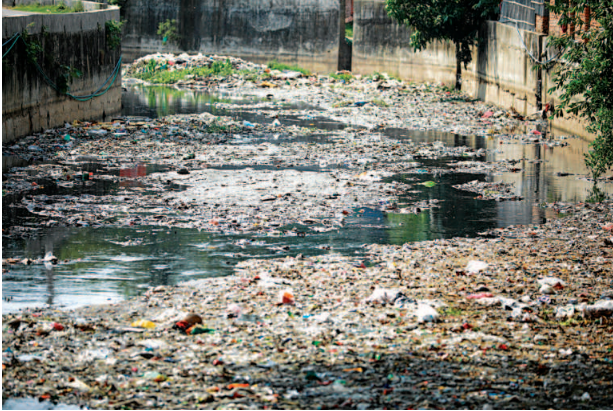
The loss of lives and civic hardships continue despite a Tk 8,626.62 crore mega project by the Chattogram Development Authority, which is currently underway, aimed solely at addressing waterlogging. This photo was taken recently in Ambagan Shaheed Lane area.