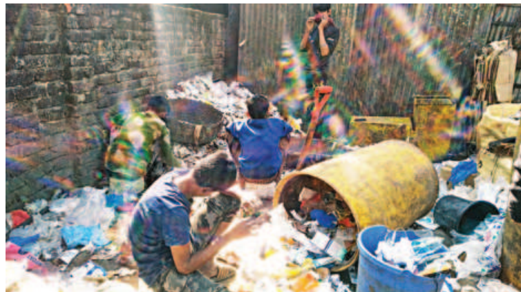
There are more than 100 private hospitals and clinics in Savar, most of which don't follow the waste management guidelines. The photo was taken at a temporary garbage station of a private hospital. FILE PHOTO

granting licences only if the hospitals or clinics submitted copies of their applications for environmental clearance along with other necessary documents. From now on, however, it will not be done without updated environmental clearance."