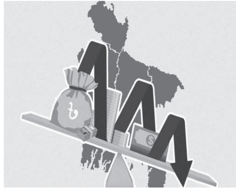
VISUAL: SHAIKH SULTANA JAHAN BADHON

What went wrong? The macroeconomic imbalances have emerged from three sources: inflationary pressure; the balance of payments pressure; and fiscal pressure.