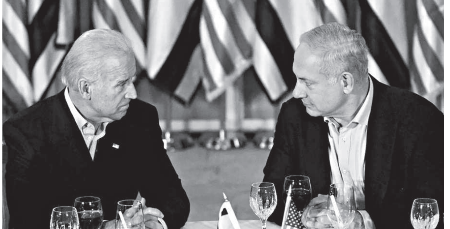
In the standoff between Joe Biden and Benjamin Netanyahu, it is Biden who seems to have the weaker hand.

Living up to his reputation as a master political manipulator, Netanyahu then adroitly shifted attention from Gaza to Iran by attacking the Iranian consulate in Damascus, Syria, killing seven senior Islamic Revolutionary Guard Corps (IRGC) officers, including two generals. The prospect of an Iranian retaliation pushed the US immediately back to the Israeli side. After the October 7 attack, Biden said, "We will make sure Israel has what it needs to take care of its citizens (and) defend itself." Secretary of State Antony