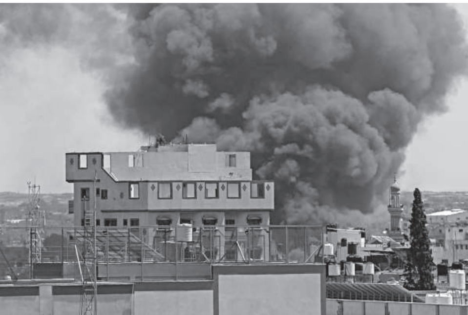
Smoke rises after an Israeli strike as Israeli forces launch a ground and air operation in the eastern part of Rafah, in the southern Gaza Strip on May 7, 2024.

This article was first published by Arab News on May 17, 2024, and is being republished with the author's permission.