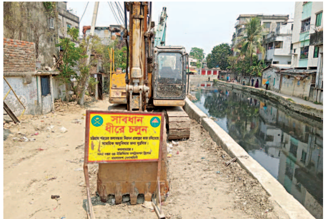
Chaktai khal in Badurtala area.

Earth was seen piled up in the canal while excavation materials were