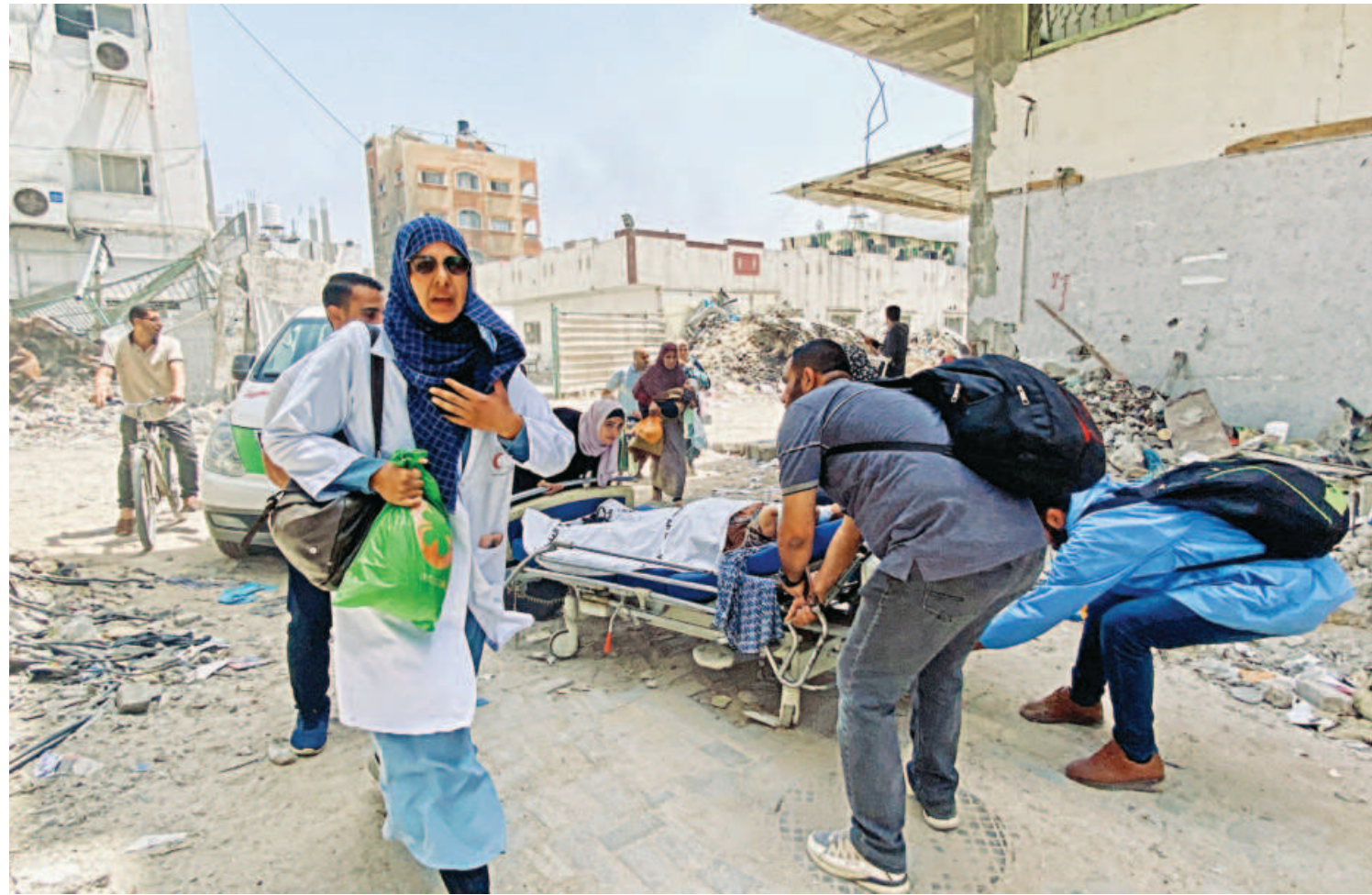
Doctors and staff of Kamal Adwan Hospital evacuate Palestinian patients following an Israeli strike in Beit Lahia in the northern Gaza Strip yesterday. Residents and medical officials said Israeli tanks were besieging the Al-Awda Hospital in Jabalia for the third day, and opened fire against Kamal Adwan Hospital in nearby Beit Lahia town.

Raisi's death has introduced "great uncertainty" in the succession, analysts said, stirring rivalries in the hardliners' camp over who will succeed Khamenei as the country's ultimate authority.