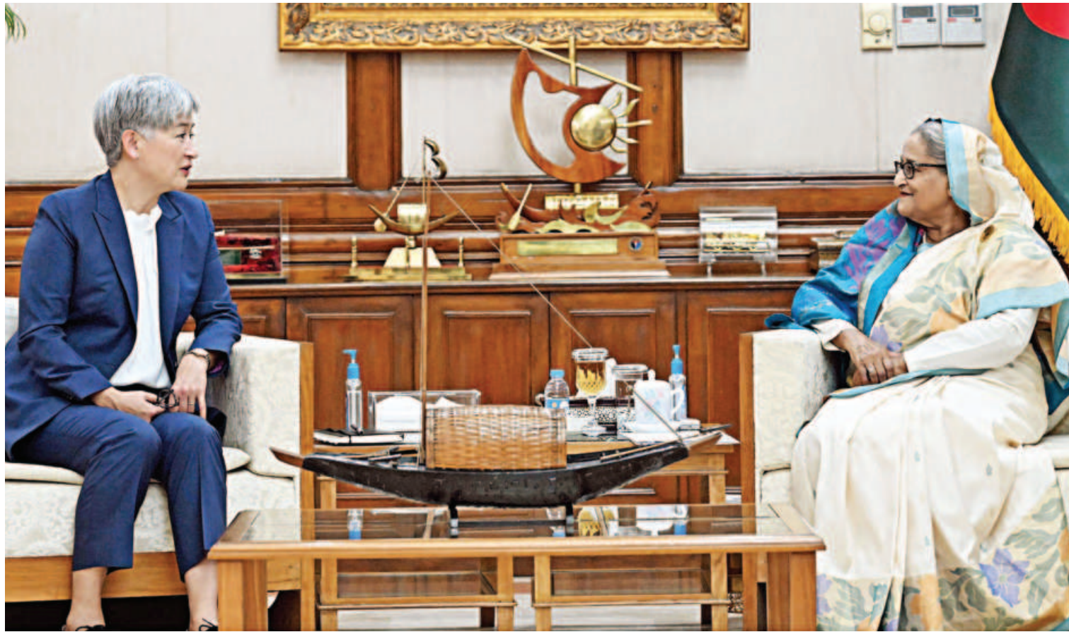
Prime Minister Sheikh Hasina at a meeting with visiting Australian Foreign Minister Penny Wong at her official residence Gono Bhaban yesterday.

He asked the Rajuk representative for the list of under-construction buildings. In response, Rajuk assured to provide the list within 10 days.