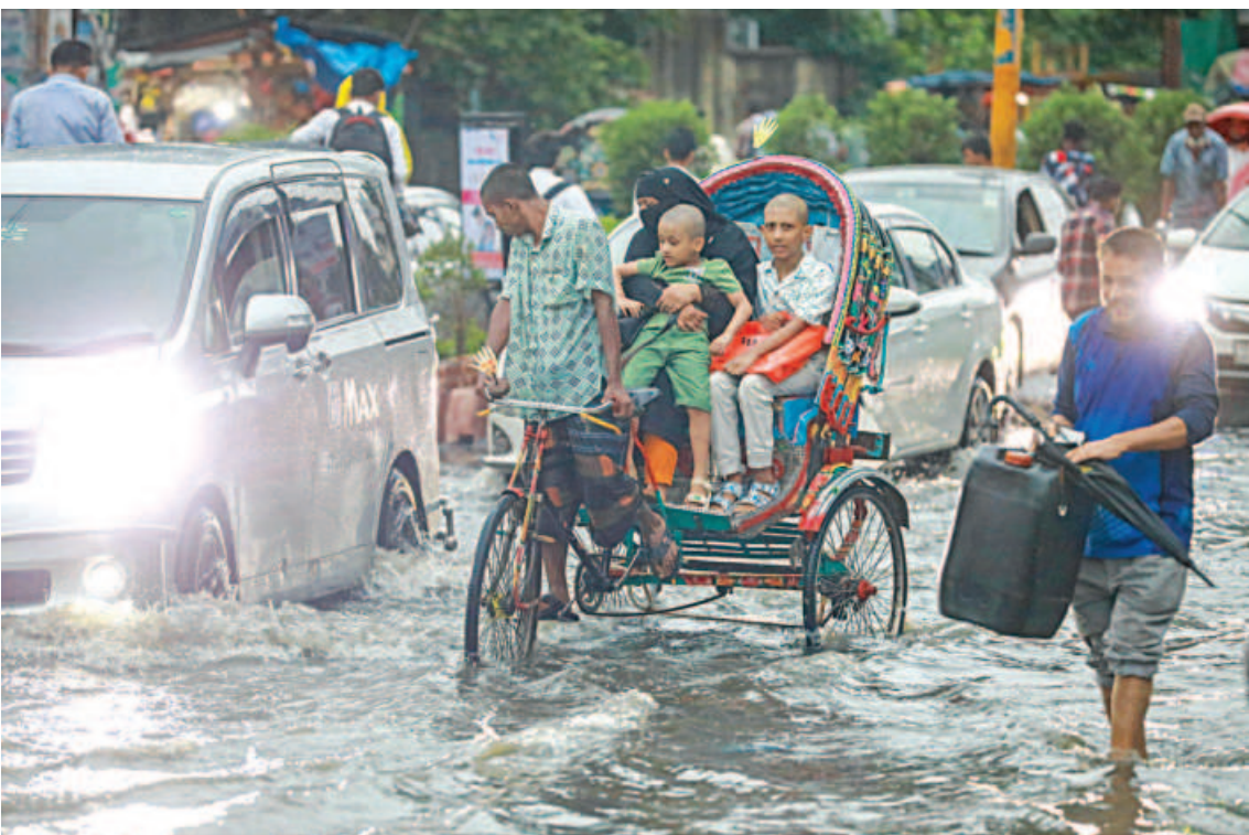
Heavy rain lasting over an hour on May 6 this year left the entire Prabartak Mor area of Chattogram city waterlogged.

"We have got 21 acres of land from Chattogram District Administration out of the 25 acres of land required for the project. Works are ongoing to dig the canal on the acquired lands," he added.