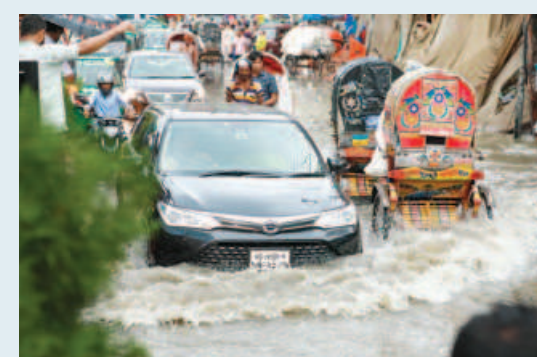
Prabartak Mor area of Chattogram city after an hour's rain on May 6.

Every monsoon, Chattogram sinks. Despite at least four ongoing projects worth Tk 14,389.36 crore, there seems to be no respite for port city dwellers. Meanwhile, project costs continue to rise with each extended deadline. With monsoon knocking at the door, port city residents are now bracing for similar suffering. In today's Page 10, we look into the current progress of the projects and people's apprehension.