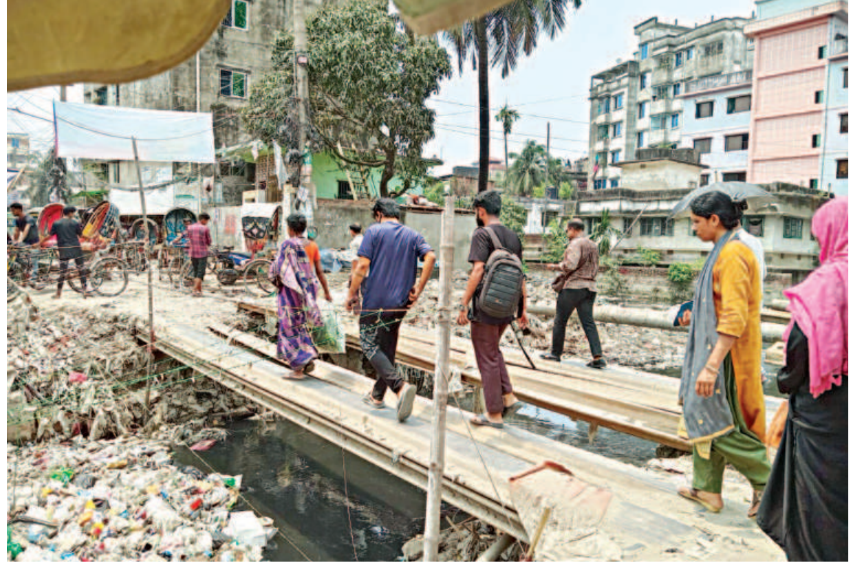
People cross this makeshift pathway, set up as part of ongoing works, in Chawkbazar Phoolta area. This temporary pathway not only makes it difficult for vehicles to cross, but also poses a risk to people as they can fall into the canal at anytime.