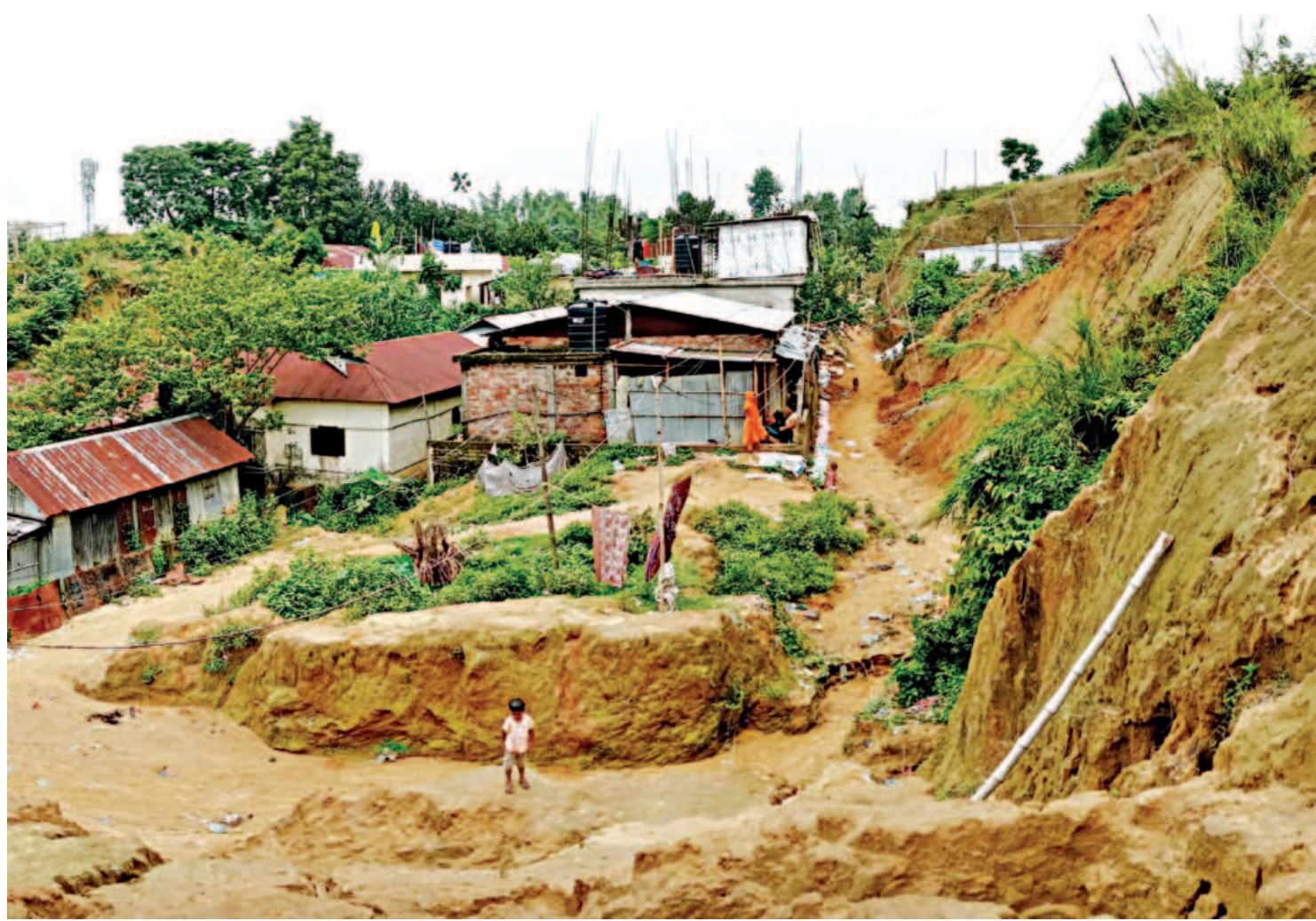
Houses built by illegally cutting a hill in the Baluchar area of Sylhet city. The hillside, scarred by unauthorised excavation, poses the danger of mudslides that can even crush the dwellings during heavy rains.

In April, the IMF revised down GDP growth forecast to SEE PAGE 6 COL 4