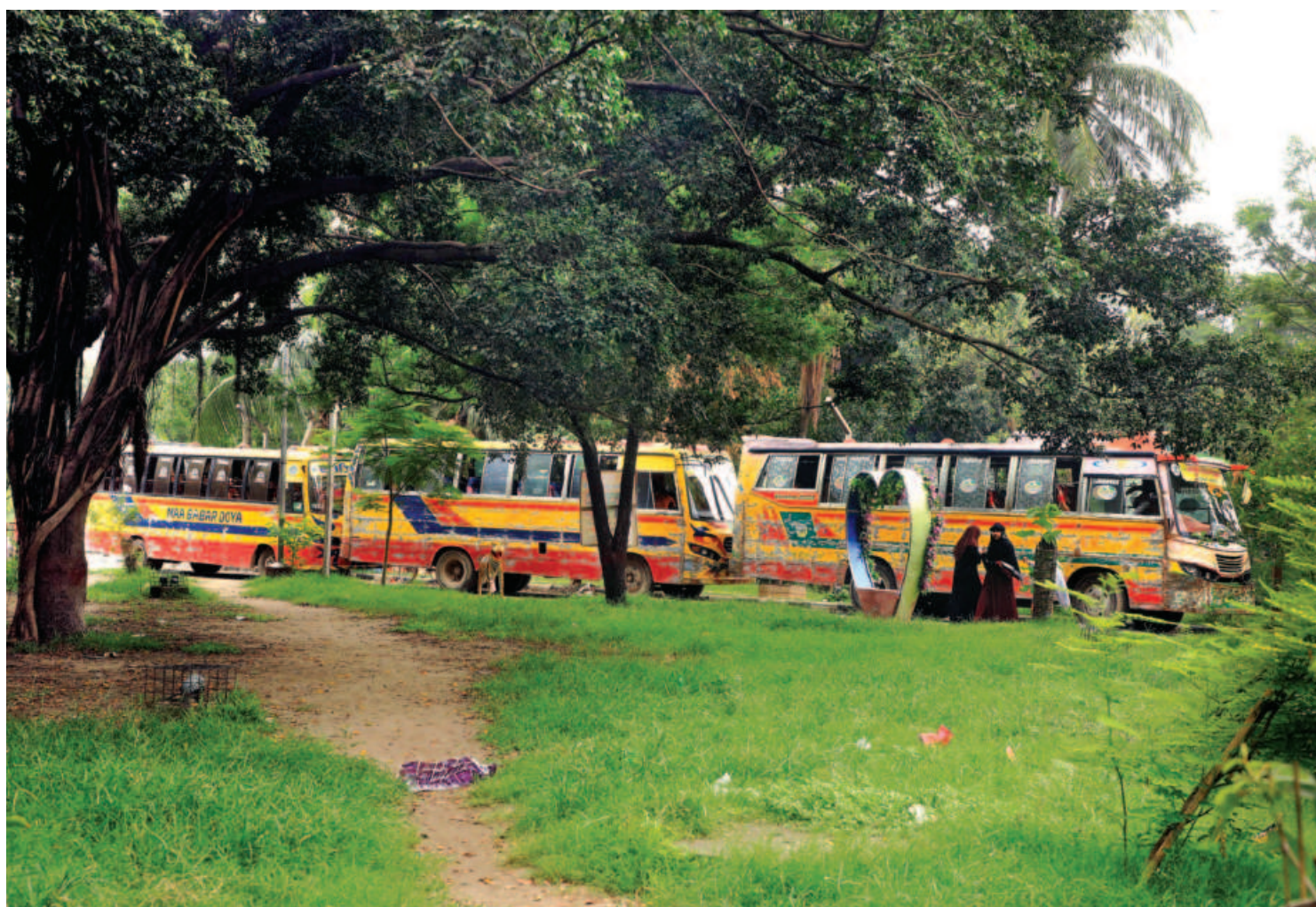
Buses are parked inside Gulistan Shaheed Matur Rahman Park, meant to provide locals with a green space in this concrete jungle. Locals say the bus owners bribe the park authorities to park there.

The High Court had in March granted him provisional permission to appeal on grounds that he might be discriminated against as a foreign national, but invited the US to submit assurances.