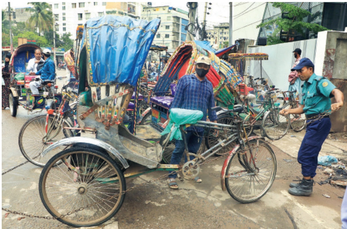
Police seize illegal battery-run rickshaws at Doyanganj intersection in Old Dhaka yesterday. Operation of electricity-powered three-wheelers with poor safety features often leads to accidents. The number of such rickshaws in the capital has been going up over the years despite a ban.