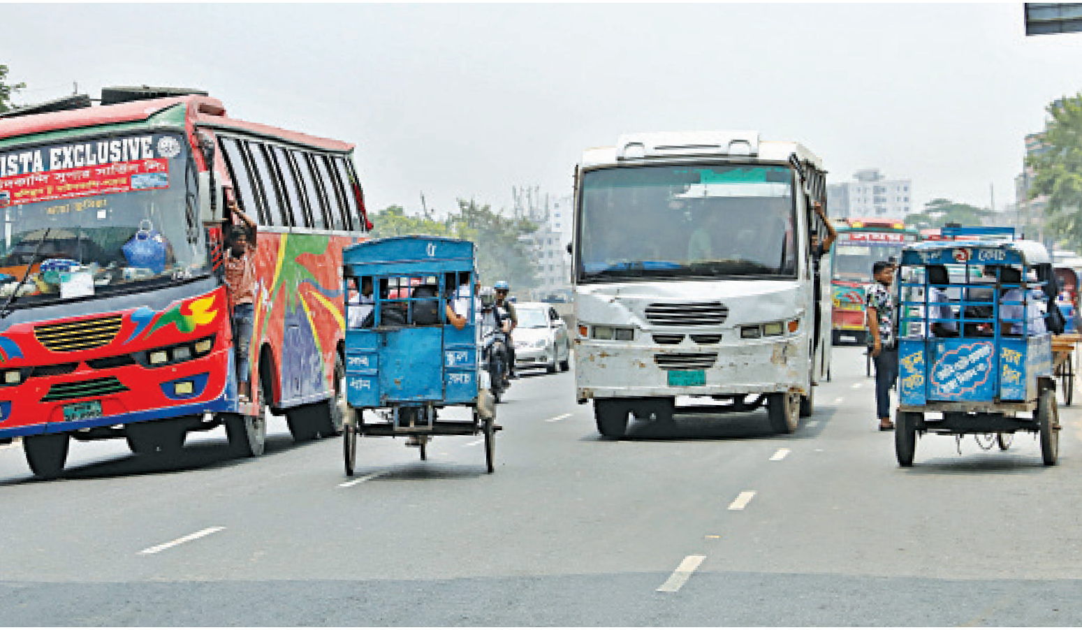
RECIPE FOR DISASTER...Two battery-powered rickshaw vans, carrying schoolchildren, weave dangerously between large buses on the busy Dhaka-Chattogram highway against traffic. Many such vans are regularly seen driving against traffic there, exposing these young students to risks of a life-changing injury or even death. Parents with limited options usually see these vans as a safer alternative. The photo was taken yesterday at Dania in Dhaka's Shanir Akhra.