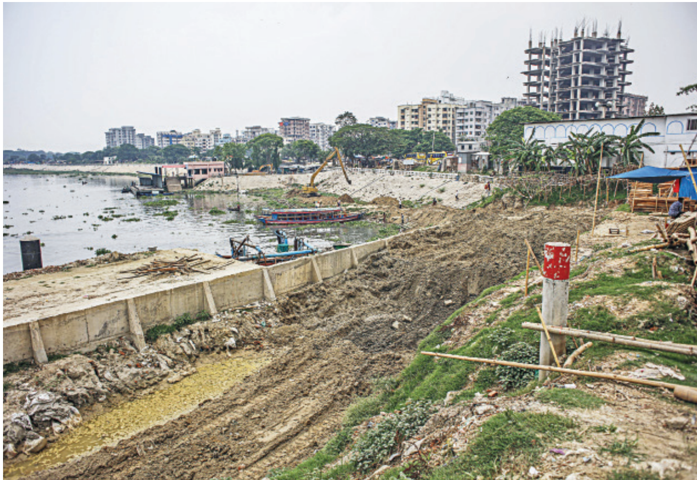
Bangladesh Inland Water Transport Authority is building a jetty well inside the demarcation pillar of the Turag in the capital's Chhoto Diabari area. The photo was taken yesterday.