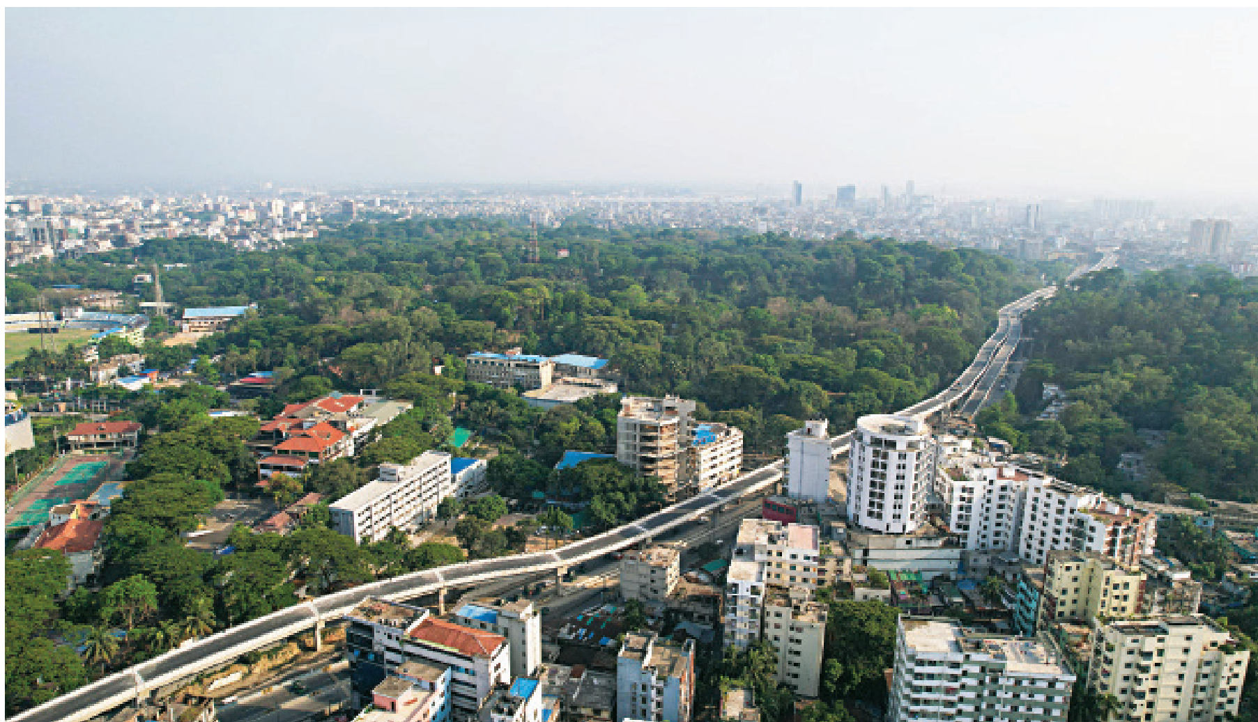
A drone shot of the almost finished 16.5km elevated expressway in Chattogram. The photo was taken in the port city's Lalkhan Bazar area recently.