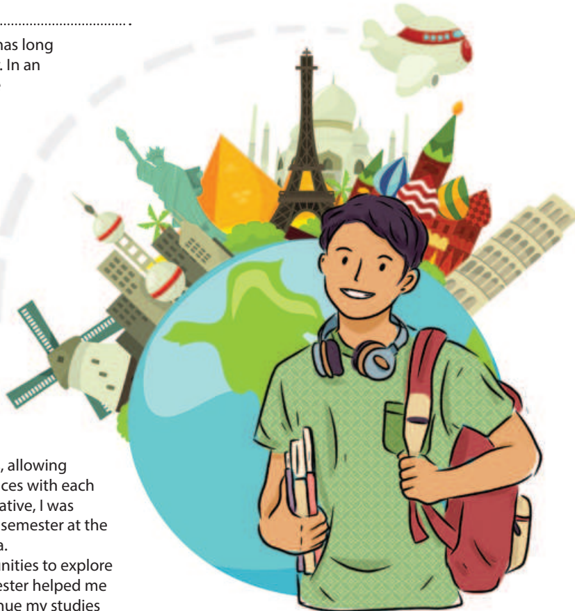
ILLUSTRATION: FAISAL BIN IQBAL

Besides, exchange semesters can serve as a gateway to higher education opportunities too. You can ask for recommendation letters from your foreign faculty members, which can be beneficial for your applications. During the exchange semester, the university offers many education fairs where you can get information for your higher studies. I got the chance to participate in an education fair where I got to know about other European universities and their offerings for master’s and PhD-seeking students. One of the European universities at the fair even offered me a good