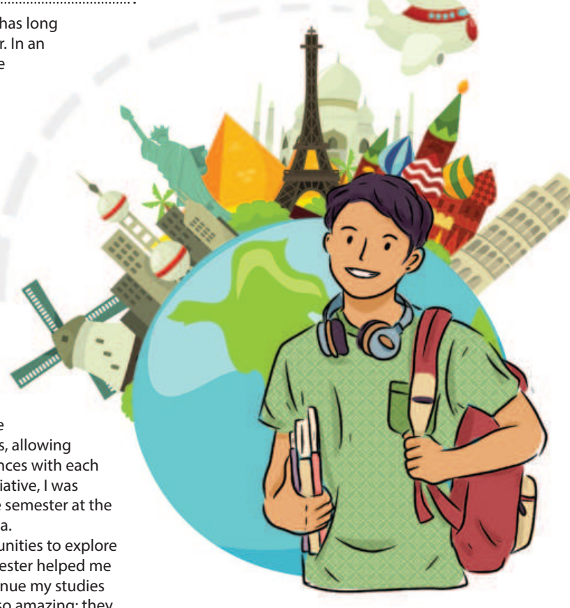
ILLUSTRATION: FAISAL BIN IQBAL

Besides, exchange semesters can serve as a gateway to higher education opportunities too. You can ask for recommendation letters from your foreign faculty members, which can be beneficial for your applications. During the exchange semester, the university offers many education fairs where you can get information for your higher studies. I got the chance to participate in an education fair where I got to know about other European universities and their offerings for master's and PhD-seeking students. One of the European universities at the fair even offered me a good