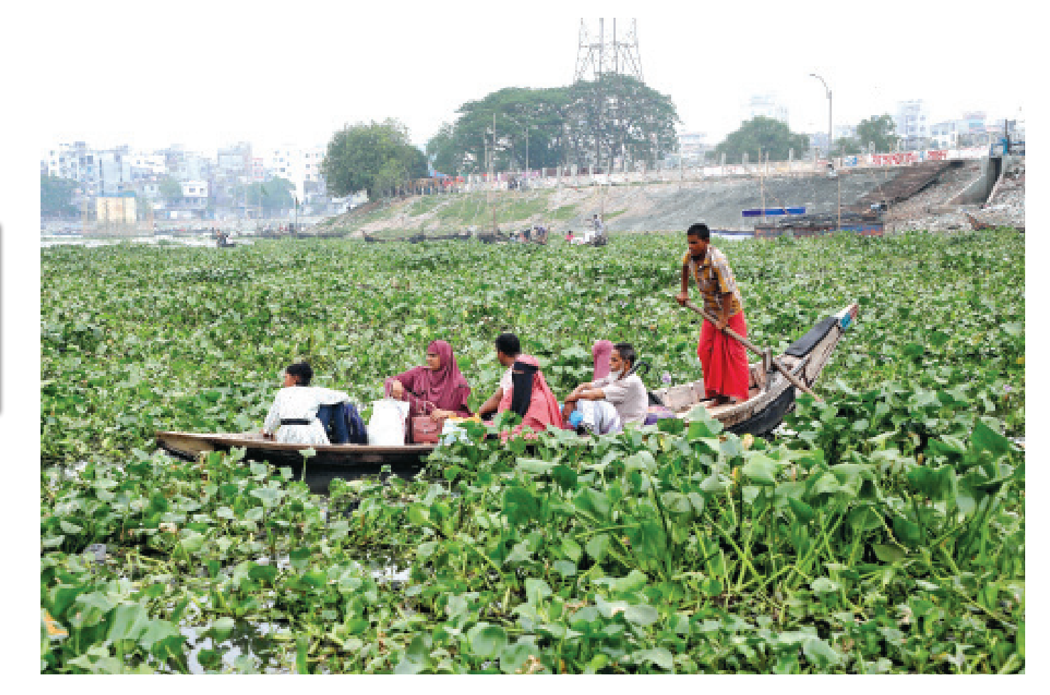
A boatman struggles to navigate through the thick water hyacinths clogging the entrance to the Buriganga Adi (old) channel. Despite the inconvenience, many residents of Kamrangirchar and Zinzira choose the boat ride from Old Dhaka as it is cheaper than road travel. The photo was taken in Dhaka's Islambagh yesterday.