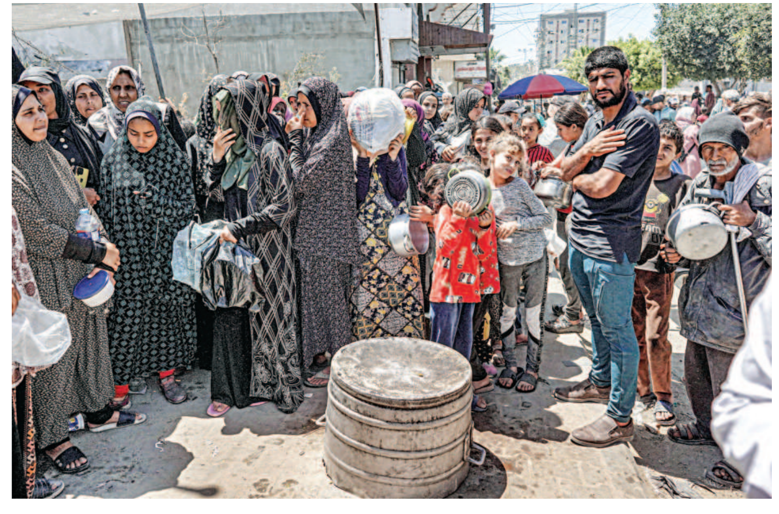
Men, women, and children queue to receive food rations from a public kitchen in Deir el-Balah in the central Gaza Strip yesterday. Israeli operations in Rafah, which borders Egypt, have closed a main crossing point for aid, which humanitarian groups say is worsening an already

The missiles wounded four Israeli soldiers, the army said, one of them moderately and the rest lightly. Earlier yesterday, Hezbollah said it launched "a swarm of explosive drones" targeting tents and "sleeping quarters" for an Israeli artillery battalion.