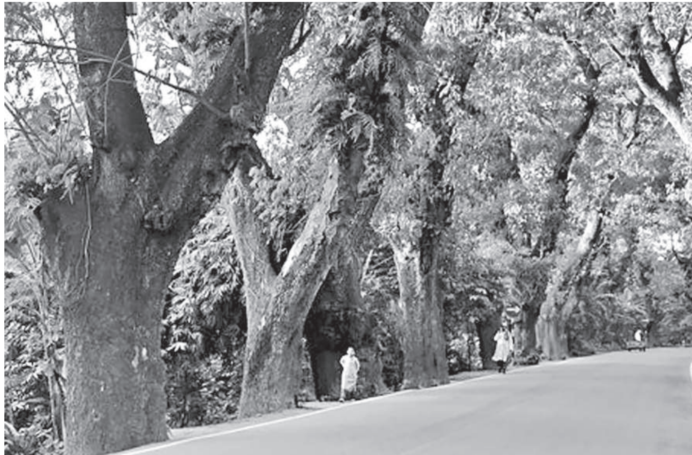
A tree-lined road in Benapole, Jashore

But significantly, we saw that it wasn't trees that were standing in the way of better roads. It was a lack of ingenuity and foresight. Across the Indian border in Petrapole, the old trees were preserved in a median, and the road was expanded without cutting trees. Environmentalists and academics asked why