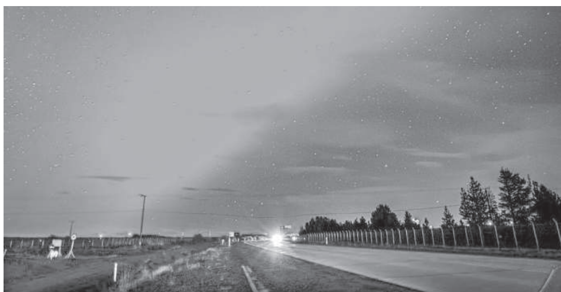
A solar storm caused a cosmic extravaganza of colourful lights that painted the skies across the Northern Hemisphere during the early hours of the May 11 weekend.

(extreme), with the recent one labelled G4 (severe). It is expected to continue for a few more days, albeit with intensity G3 (strong) or G2 (moderate).