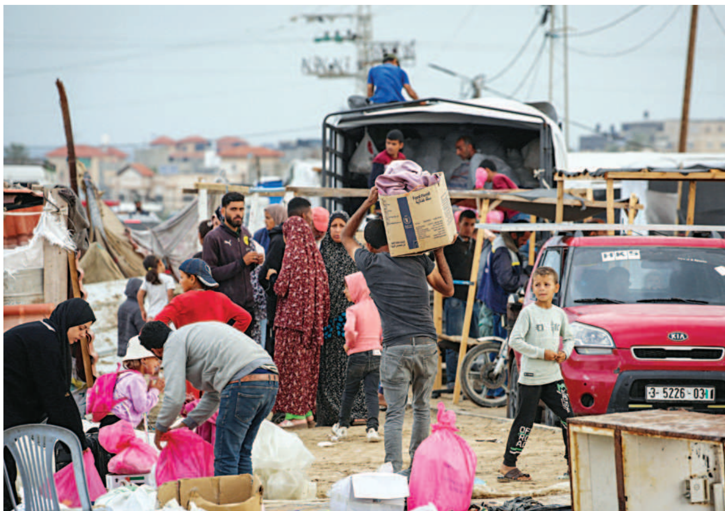
Palestinians pack their belongings as they prepare to flee Rafah in the southern Gaza Strip yesterday.