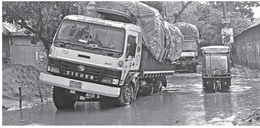
A truck remains stuck on Sakhipur-Sagardighi Road in Tangail after hitting a submerged pothole yesterday. The road has been in a dilapidated condition for a long time due to heavy traffic and lack of maintenance.

According to the EC schedule, the third phase upazila election will be held in 112 upazilas on May 29, while second phase will be held in 160 upazilas on May 21.