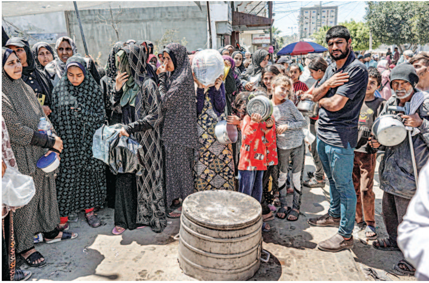
Men, women, and children queue to receive food rations from a public kitchen in Deir el-Balah in the central Gaza Strip yesterday. Israeli operations in Rafah, which borders Egypt, have closed a main crossing point for aid, which humanitarian groups say is worsening an already dire situation.

The Eindhoven University of Technology confirmed that there were "dozens of students peacefully protesting outside next to ten to 15 tents". Students in the Netherlands have been protesting against Israel's offensive in Gaza since last Monday and Dutch riot police previously clashed with protesters at the University of Amsterdam.