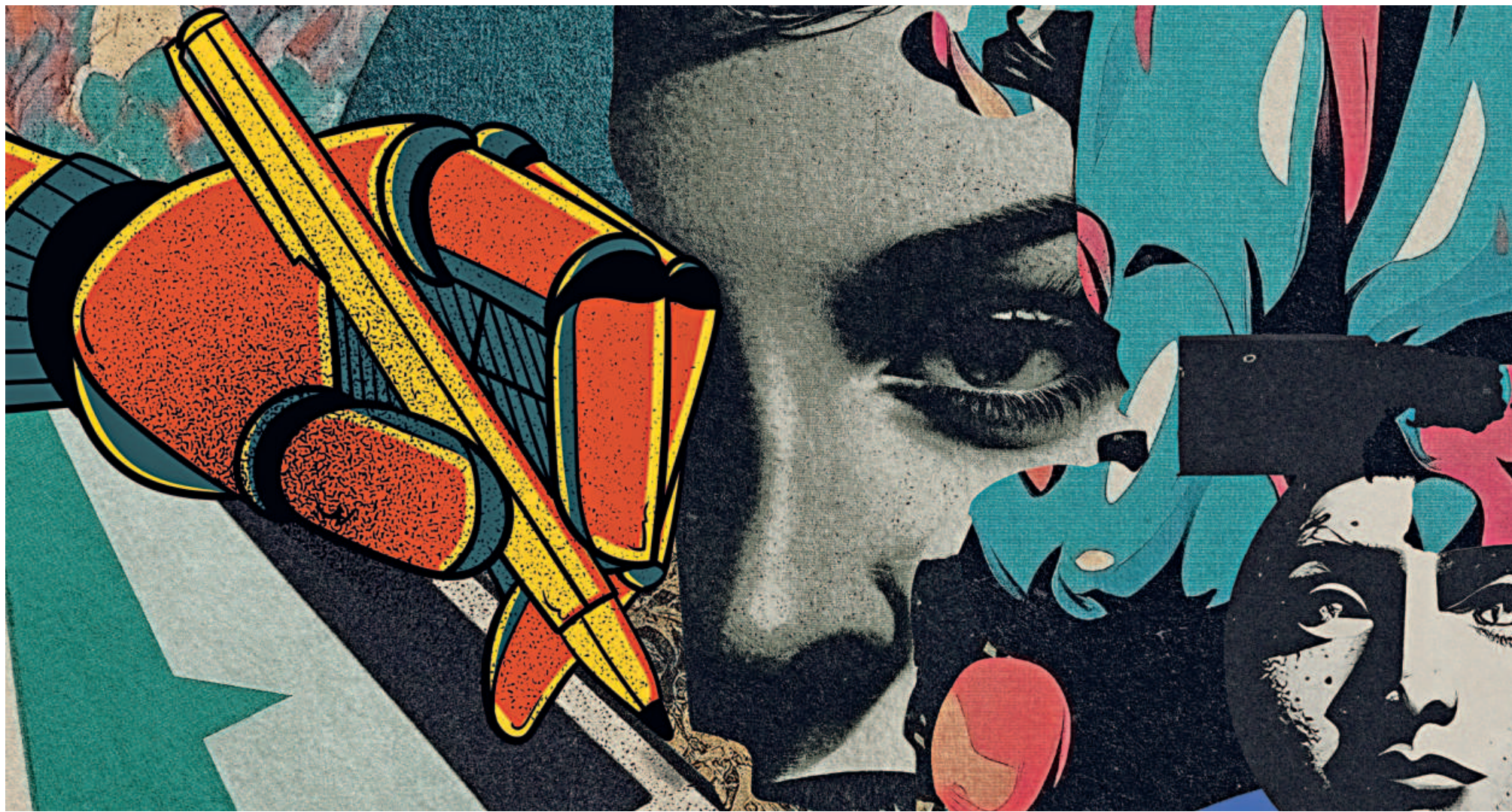
ILLUSTRATION: ZARIF FAIAZ

Is AI truly more creative than humans? What are the ethical implications of AI-generated art that imitates existing styles? How will the rise of AI impact the job market for creative professionals?