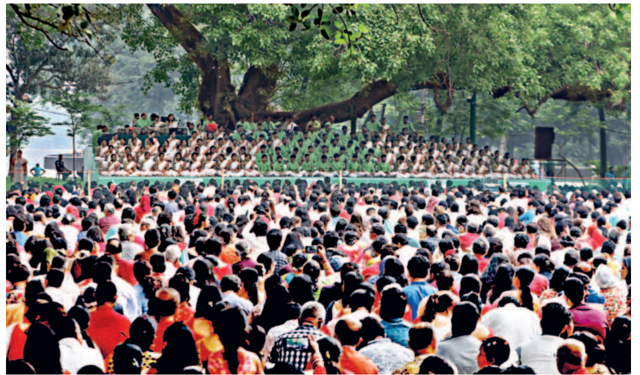
Chhayanaat's celebration of the Bengali New Year.

Tagore would insist that the poem was not in praise of King George and the word "Chirasarathi," which he translated as "Eternal Charioteer" in his translation of 1919, referred to Krishna. However, it is not improbable that in 1911 with the annulment of the partition of Bengal, Tagore was celebrating the reunification of India – but it was a reunification that had been made possible by the then ruler