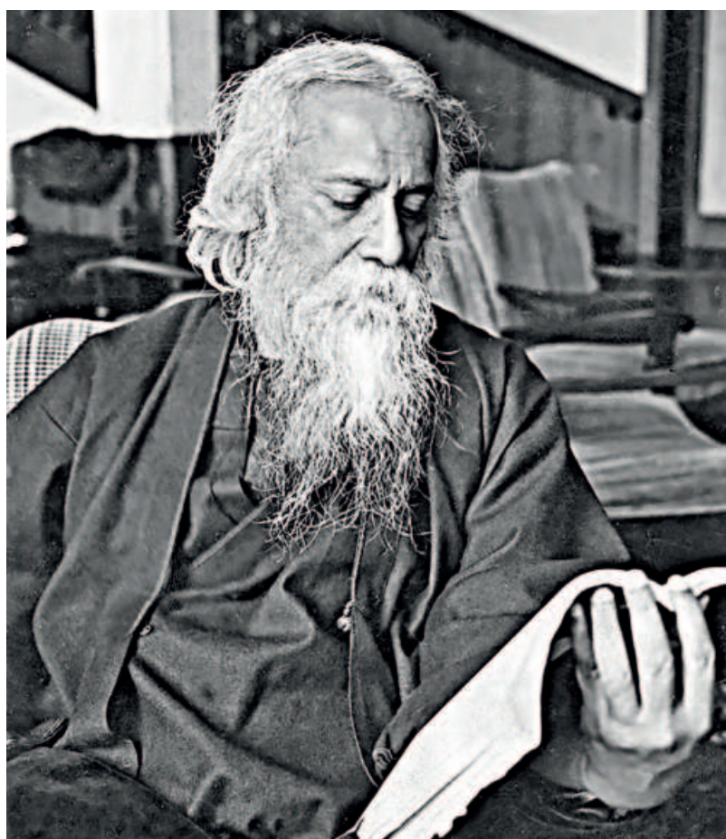
Rabindranath Tagore (1861-1941)

In January 1912, the Brahma Samaj journal, Tatva Bodha Prakasika , published the song. Below is a transliteration of the first stanza.