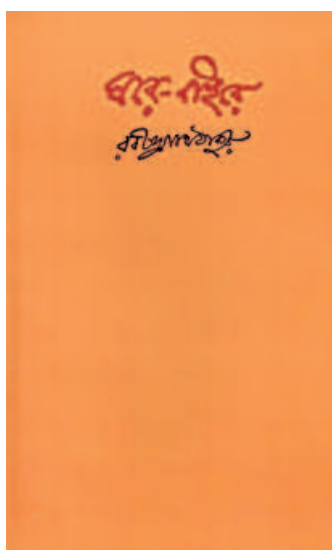
(L) Cover of the novel Ghare Baire . (R) A facsimile of two verses of the translation in Tagore's handwriting

"Rabindranath Tagore and the Creation of National Identity" was first presented at the conference on "Redefining Paradigms of Sustainable Development in South Asia," organized by Sustainable Development Policy Institute, Islamabad, Pakistan, in December 2011. This is a shorter version of the developed essay published in Chaos, IUB Studies in Literature, Language and Creative Writing , Fall 2012.